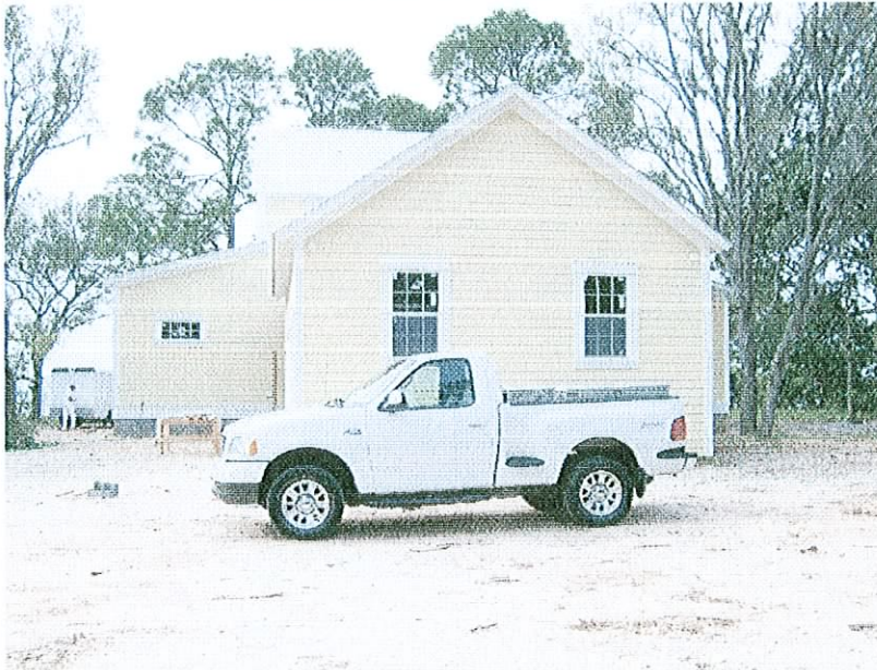
28 MARCH 2007 -- REAR VIEW