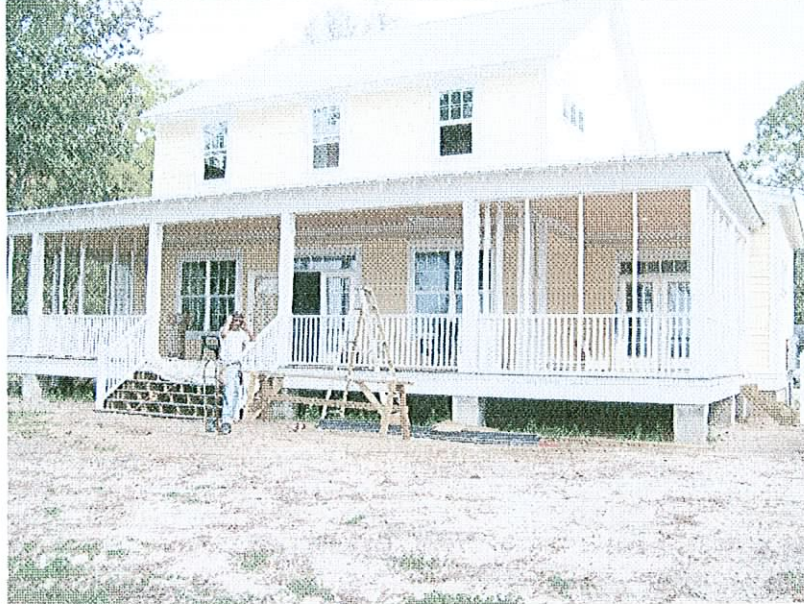
28 MARCH 2007 -- FRONT VIEW

If using the Elevation Certificate to obtain NFIP flood insurance, affix at least two building photographs below according to the instructions for Item A6. Identify all photographs with: date taken; "Front View" and "Rear View"; and, if required, "Right Side View" and "Left Side View." If submitting more photographs than will fit on this page, use the Continuation Page, following.