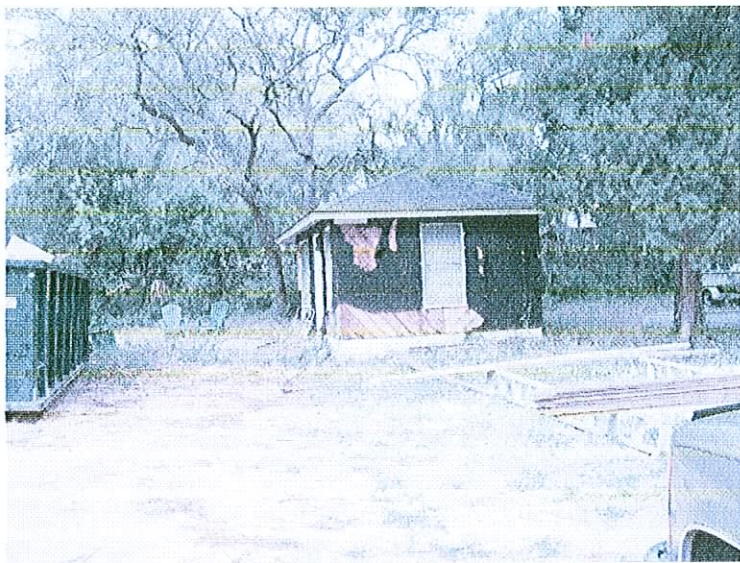
28 MARCH 2007 – OUT BUILDING

If submitting more photographs than will fit on the preceding page, affix the additional photographs below. Identify all photographs with: date taken; "Front View" and "Rear View"; and, if required, "Right Side View" and "Left Side View."