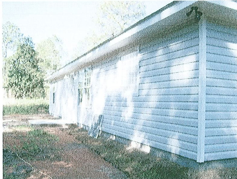
12 APRIL 2007 – REAR VIEW