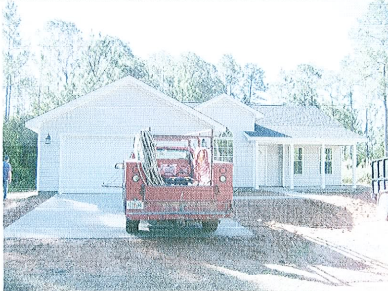
12 APRIL 2007 – FRONT VIEW

If using the Elevation Certificate to obtain NFIP flood insurance, affix at least two building photographs below according to the instructions for Item A6. Identify all photographs with: date taken; "Front View" and "Rear View"; and, if required, "Right Side View" and "Left Side View." If submitting more photographs than will fit on this page, use the Continuation Page, following.