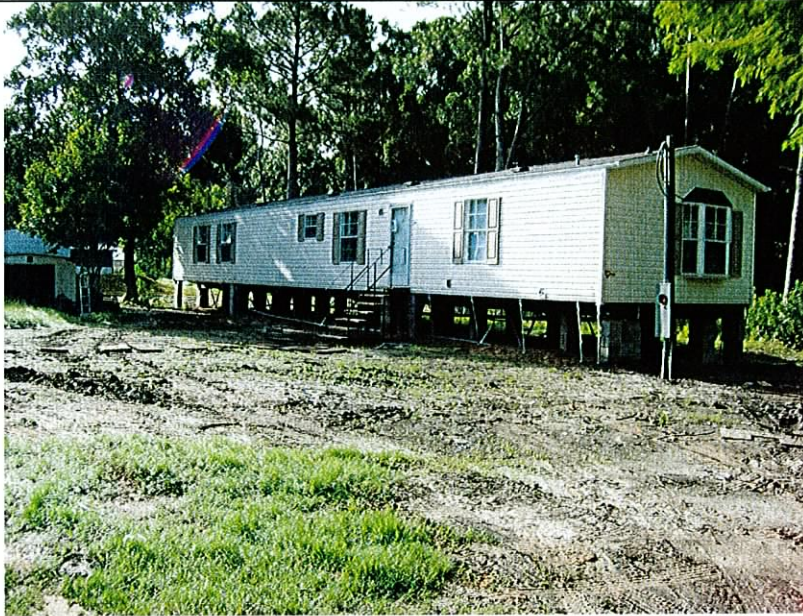
10 JULY 2008 -- FRONT VIEW

If using the Elevation Certificate to obtain NFIP flood insurance, affix at least two building photographs below according to the instructions for Item A6. Identify all photographs with: date taken; "Front View" and "Rear View"; and, if required, "Right Side View" and "Left Side View." If submitting more photographs than will fit on this page, use the Continuation Page, following.