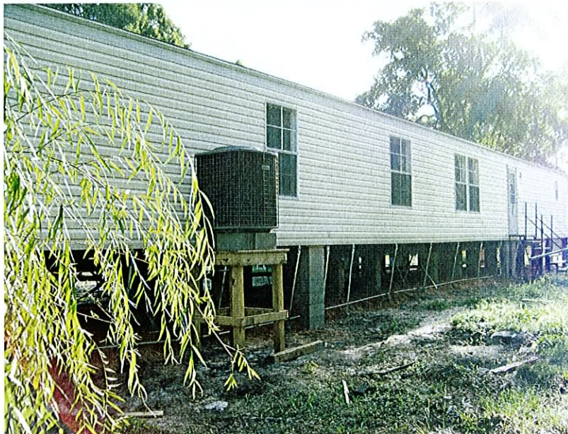
10 JULY 2008 -- REAR VIEW