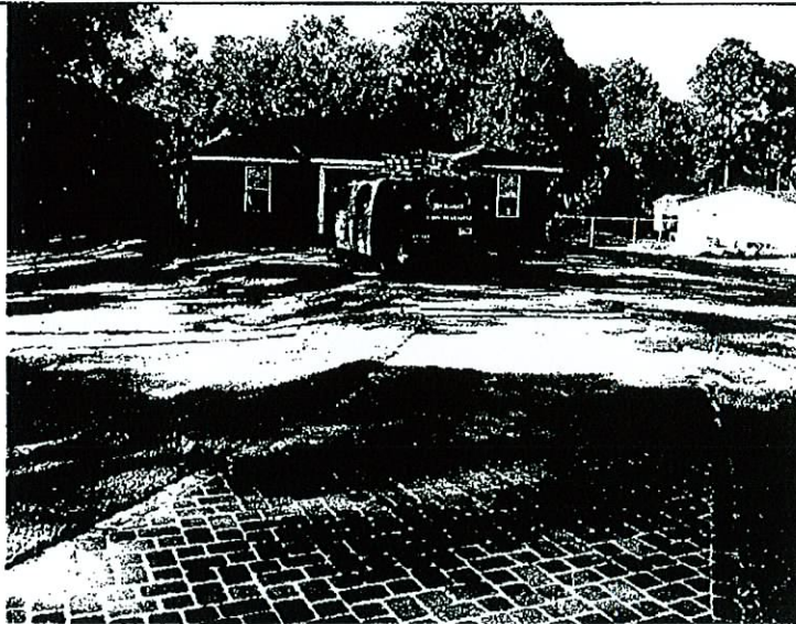
17 NOVEMBER 2007 – FRONT VIEW

If using the Elevation Certificate to obtain NFIP flood insurance, affix at least two building photographs below according to the instructions for Item A6. Identify all photographs with: date taken; "Front View" and "Rear View"; and, if required, "Right Side View" and "Left Side View." If submitting more photographs than will fit on this page, use the Continuation Page, following.