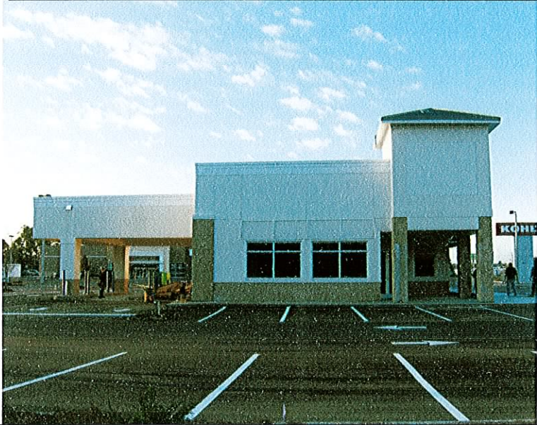
North Side of Bank - 2/29/2008

If using the Elevation Certificate to obtain NFIP flood insurance, affix at least two building photographs below according to the instructions for Item A6. Identify all photographs with: date taken; "Front View" and "Rear View"; and, if required, "Right Side View" and "Left Side View." If submitting more photographs than will fit on this page, use the Continuation Page, following.