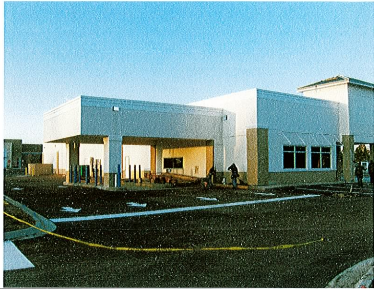
Northeast Side of Bank - 2/29/2008