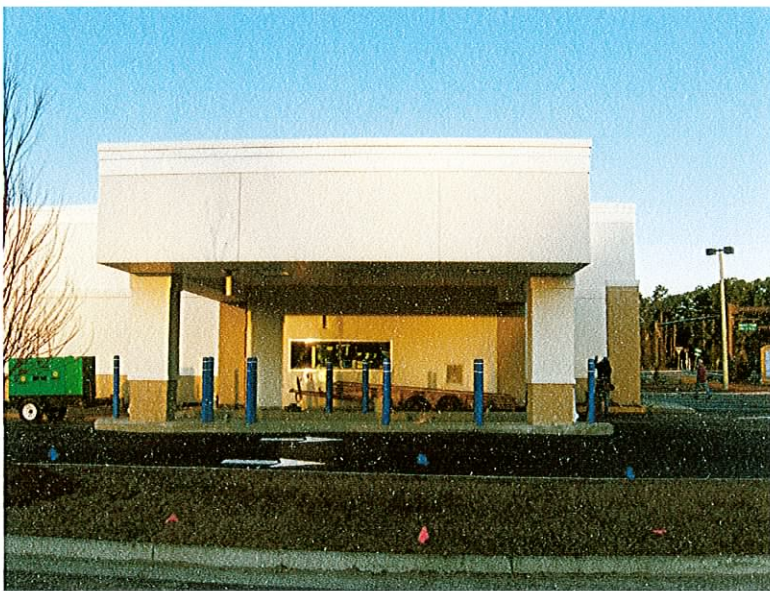
East Side of Bank - 2/29/2008