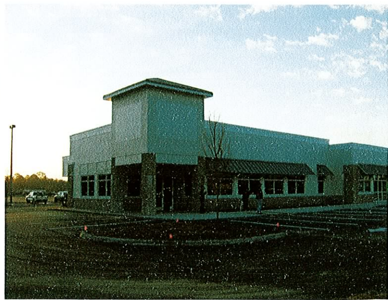
Northwest Side of Bank - 2/29/2008