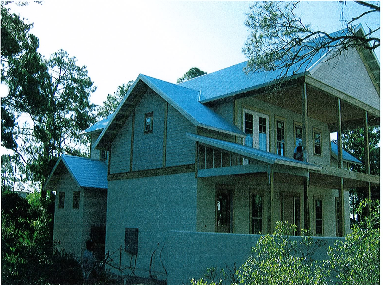
FRONT & LEFT SIDE VIEW 9/18/07

If using the Elevation Certificate to obtain NFIP flood insurance, affix at least two building photographs below according to the instructions for Item A6. Identify all photographs with: date taken; "Front View" and "Rear View"; and, if required, "Right Side View" and "Left Side View." If submitting more photographs than will fit on this page, use the Continuation Page, following.