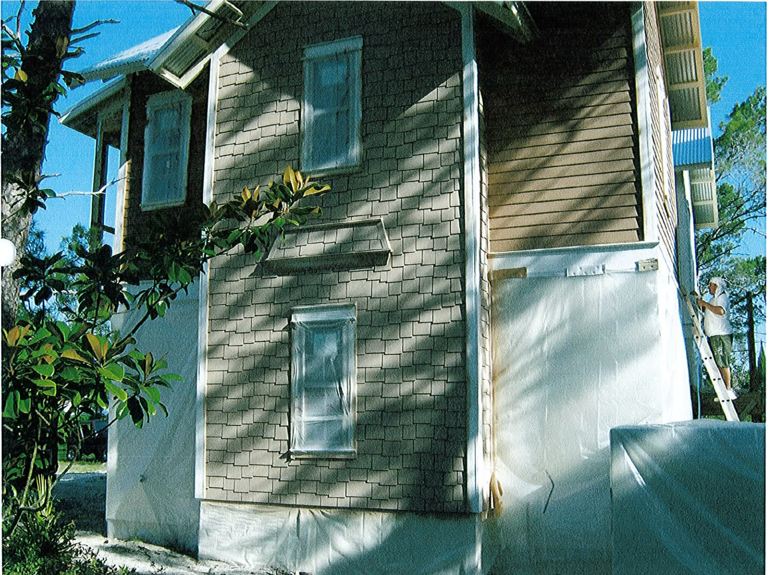
RIGHT SIDE VIEW GARAGE 9/18/07

If submitting more photographs than will fit on the preceding page, affix the additional photographs below. Identify all photographs with: date taken; "Front View" and "Rear View"; and, if required, "Right Side View" and "Left Side View."