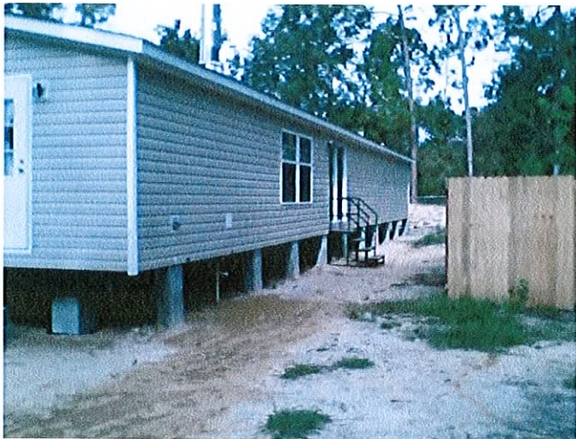
BACK VIEW LOOKING WEST – 8/07/08