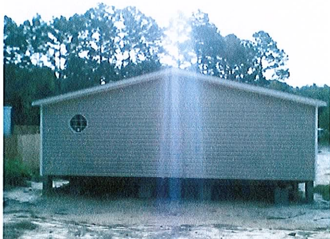
WEST SIDE VIEW LOOKING EAST – 8/03/08