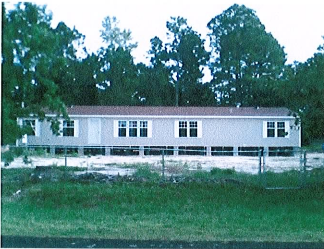
FRONT VIEW LOOKING NORTH – 8/07/08

If using the Elevation Certificate to obtain NFIP flood insurance, affix at least two building photographs below according to the instructions for Item A6. Identify all photographs with: date taken; "Front View" and "Rear View"; and, if required, "Right Side View" and "Left Side View." If submitting more photographs than will fit on this page, use the Continuation Page, following.