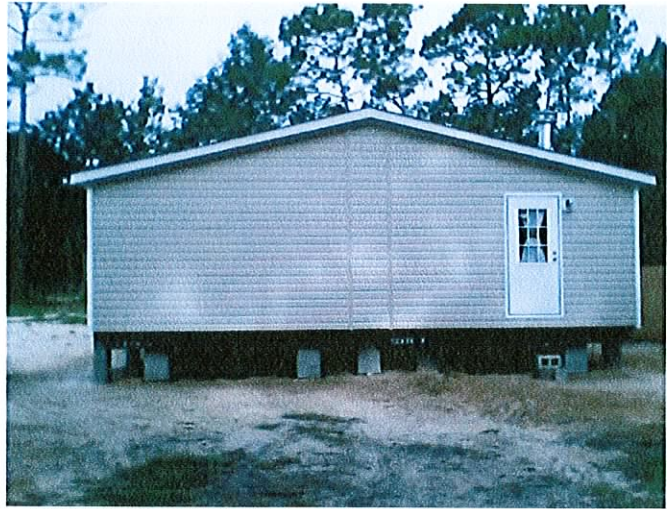
RIGHT SIDE VIEW LOOKING WEST – 8/07/08