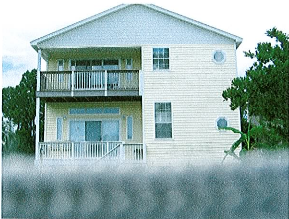
6/11/2008 – BACK VIEW