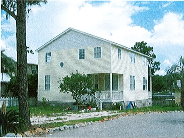
6/11/2008 – FRONT VIEW

If using the Elevation Certificate to obtain NFIP flood insurance, affix at least two building photographs below according to the instructions for Item A6. Identify all photographs with: date taken; "Front View" and "Rear View"; and, if required, "Right Side View" and "Left Side View." If submitting more photographs than will fit on this page, use the Continuation Page, following.