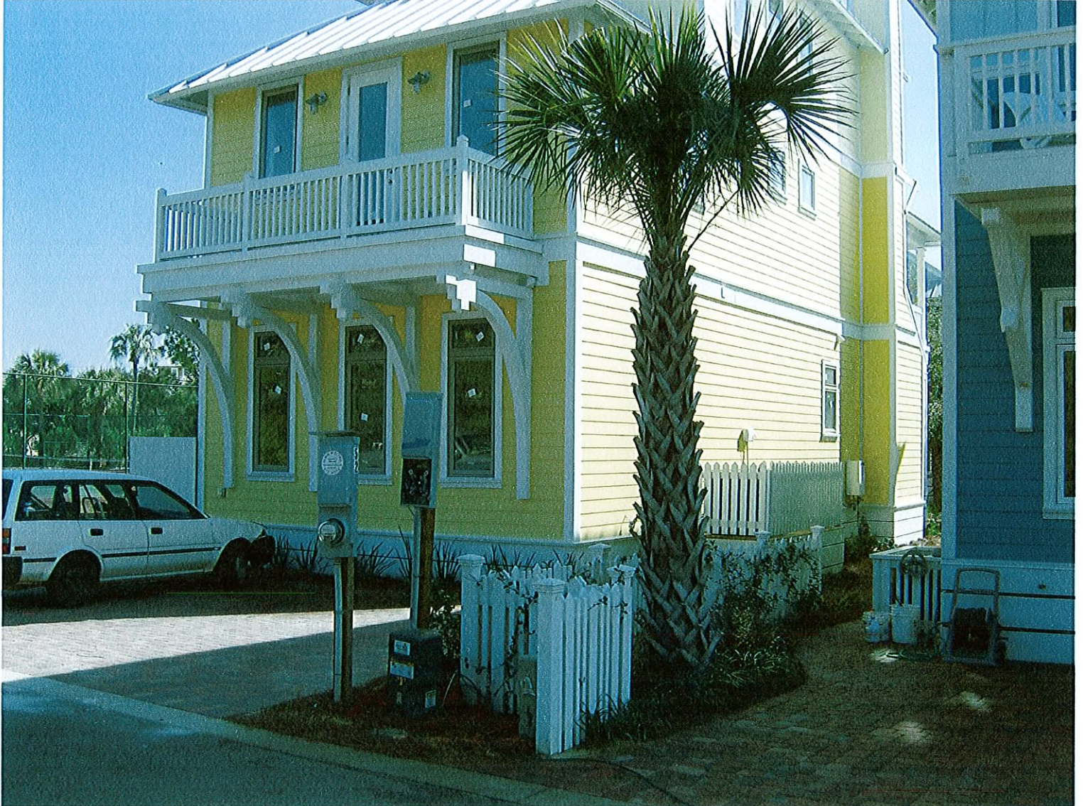
REAR VIEW 2/04/08

If submitting more photographs than will fit on the preceding page, affix the additional photographs below. Identify all photographs with: date taken; "Front View" and "Rear View"; and, if required, "Right Side View" and "Left Side View."