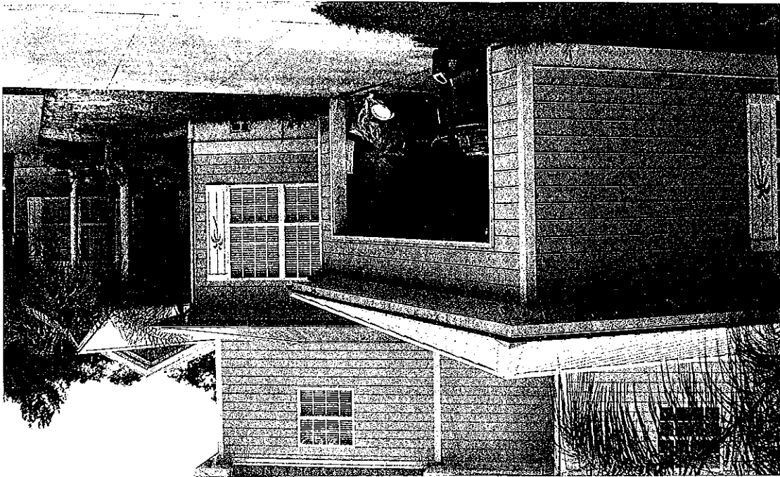
Front View 06/05/09

If using the Elevation Certificate to obtain NFIP flood insurance, affix at least two building photographs below according to the instructions for Item A6. Identify all photographs with: date taken; "Front View" and "Rear View"; and, if required, "Right Side View" and "Left Side View." If submitting more photographs than will fit on this page, use the Continuation Page on the reverse.