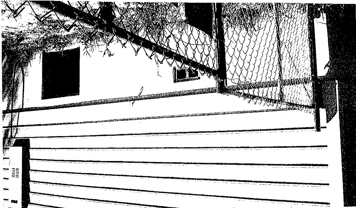
Right Side View 06/05/09

If submitting more photographs than will fit on the preceding page, affix the additional photographs below. Identify all photographs with: date taken, "Front View" and "Rear View", and, if required, "Right Side View" and "Left Side View."