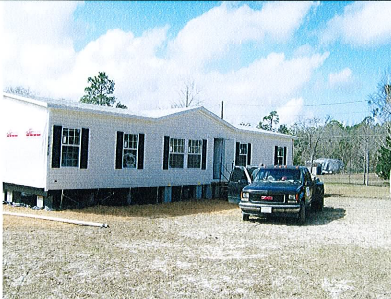
11 MARCH 2009 -- FRONT VIEW

If using the Elevation Certificate to obtain NFIP flood insurance, affix at least two building photographs below according to the instructions for Item A6. Identify all photographs with: date taken; "Front View" and "Rear View"; and, if required, "Right Side View" and "Left Side View." If submitting more photographs than will fit on this page, use the Continuation Page, following.