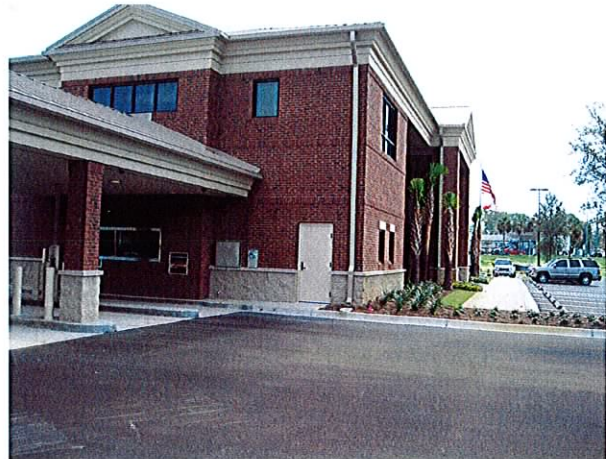
SIDE VIEW- WEST