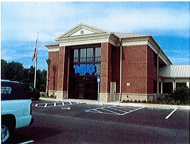
SIDE VIEW- EAST