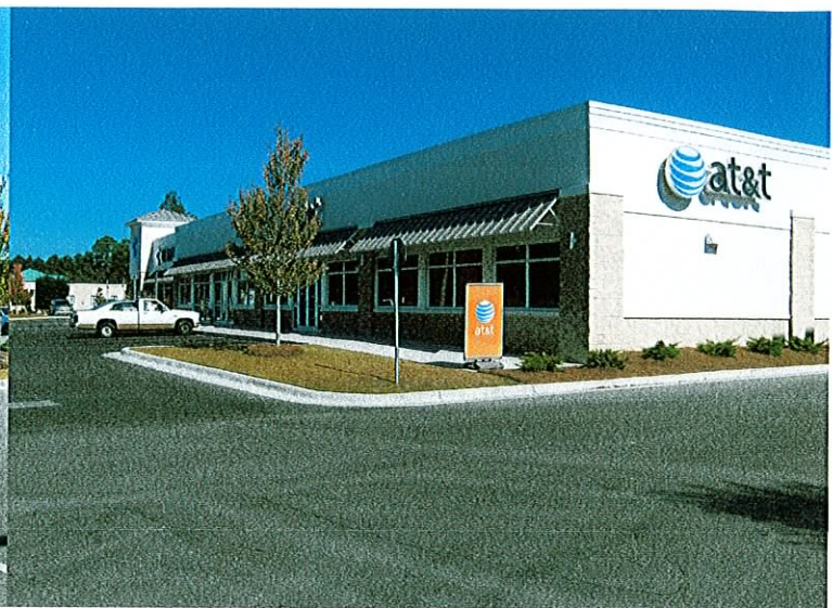
Southwest side of South end unit – Nov. 2008