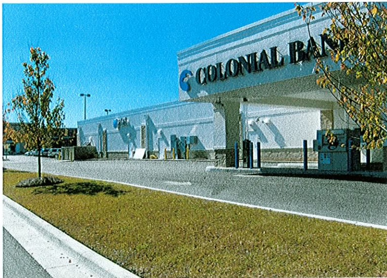
NE view of building