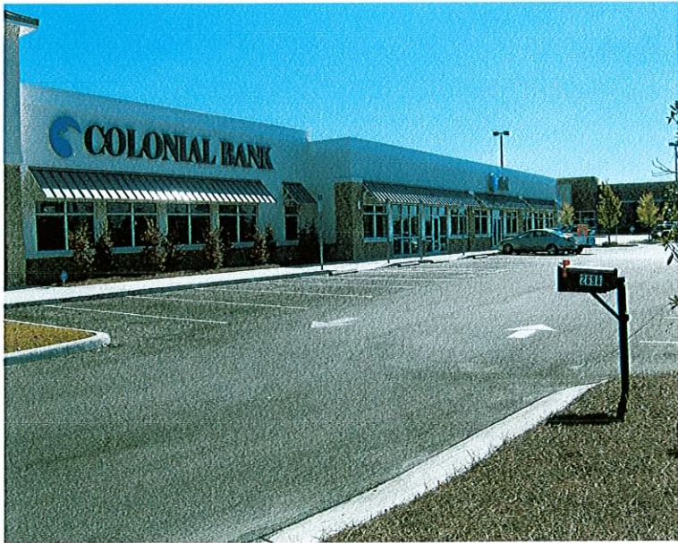
NW view of building

If submitting more photographs than will fit on the preceding page, affix the additional photographs below. Identify all photographs with: date taken; "Front View" and "Rear View"; and, if required, "Right Side View" and "Left Side View."