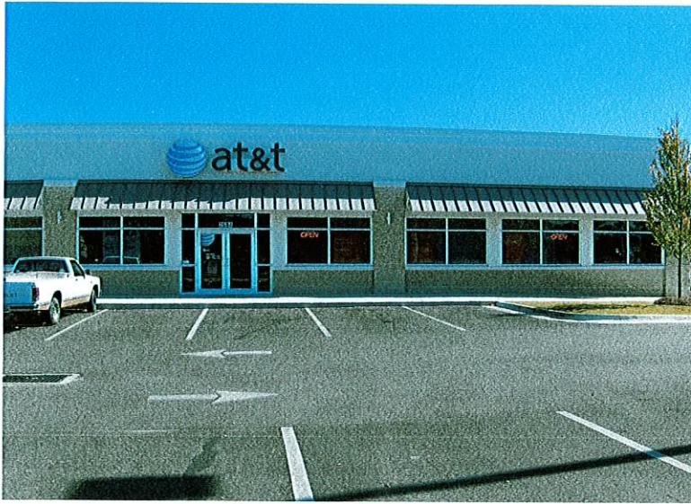
West side of South end unit – Nov. 2008

If using the Elevation Certificate to obtain NFIP flood insurance, affix at least two building photographs below according to the instructions for Item A6. Identify all photographs with: date taken; "Front View" and "Rear View"; and, if required, "Right Side View" and "Left Side View." If submitting more photographs than will fit on this page, use the Continuation Page, following.