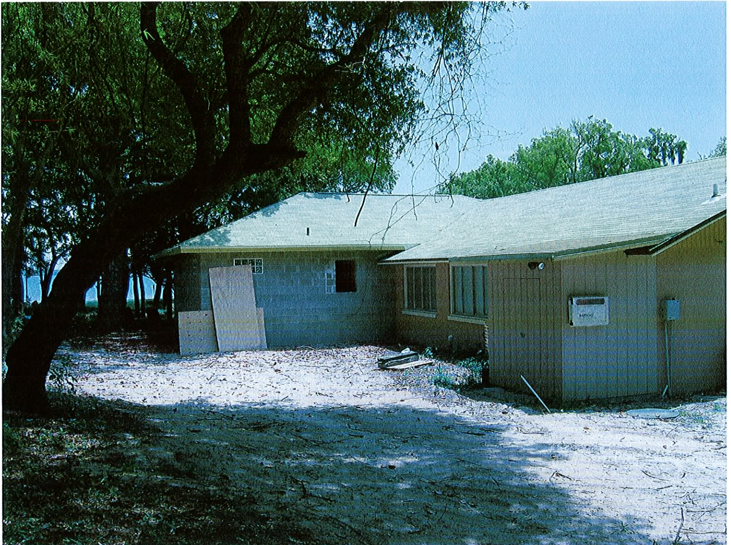
FRONT AND LEFT VIEW 5/27/08

If using the Elevation Certificate to obtain NFIP flood insurance, affix at least two building photographs below according to the instructions for Item A6. Identify all photographs with: date taken; "Front View" and "Rear View"; and, if required, "Right Side View" and "Left Side View." If submitting more photographs than will fit on this page, use the Continuation Page, following.