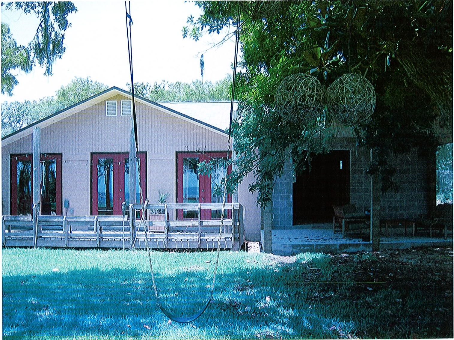
REAR VIEW 5/27/08

If submitting more photographs than will fit on the preceding page, affix the additional photographs below. Identify all photographs with: date taken; "Front View" and "Rear View"; and, if required, "Right Side View" and "Left Side View."