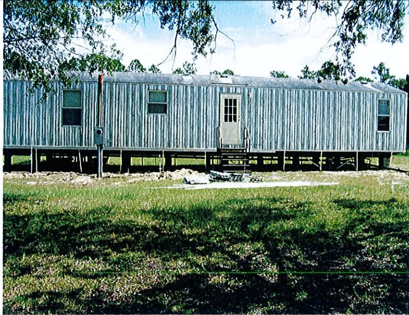
15 SEPTEMBER 2009 -- REAR VIEW

If using the Elevation Certificate to obtain NFIP flood insurance, affix at least two building photographs below according to the instructions for Item A6. Identify all photographs with: date taken; "Front View" and "Rear View"; and, if required, "Right Side View" and "Left Side View." If submitting more photographs than will fit on this page, use the Continuation Page on the reverse.