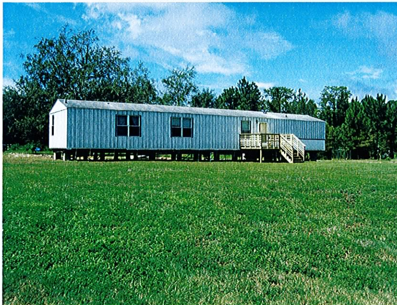
15 SEPTEMBER 2009 -- FRONT VIEW