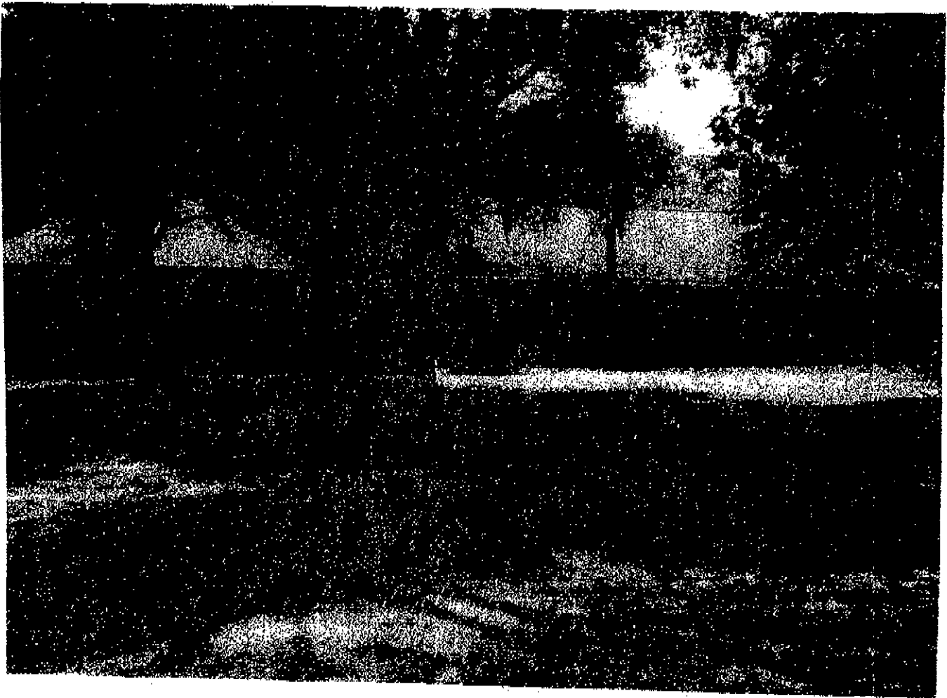
8/13/2009 FRONT VIEW

If using the Elevation Certificate to obtain NFIP flood insurance, affix at least two building photographs below according to the instructions for Item A6. Identify all photographs with: date taken; "Front View" and "Rear View"; and, if required, "Right Side View" and "Left Side View." If submitting more photographs than will fit on this page, use the Continuation Page on the reverse.