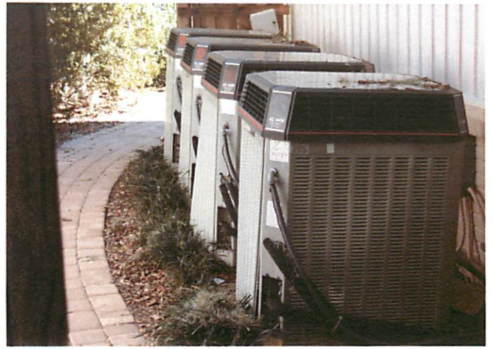
4 Air Conditioners