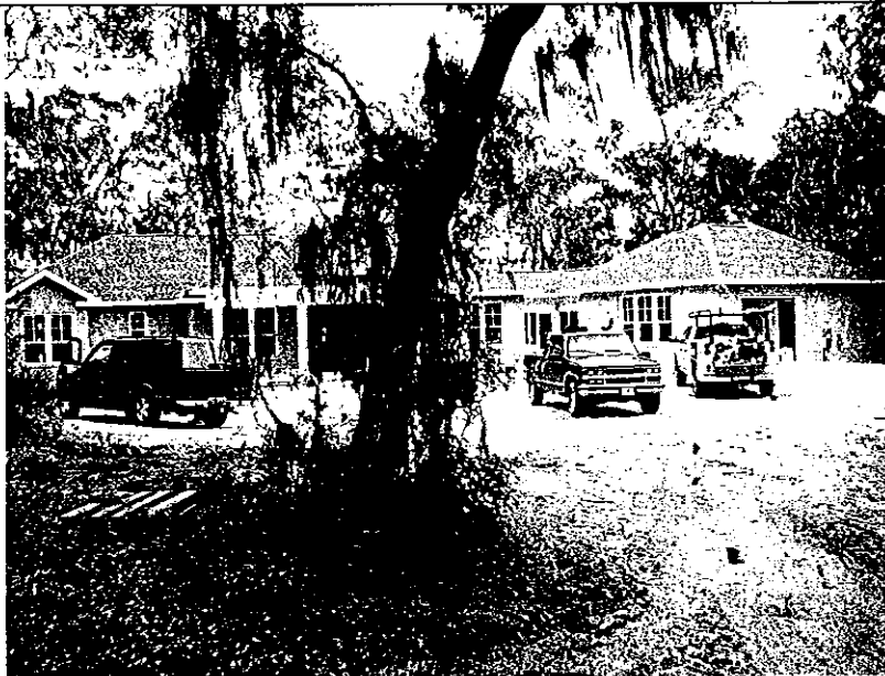
26 OCTOBER 2009 -- FRONT VIEW

If using the Elevation Certificate to obtain NFIP flood insurance, affix at least two building photographs below according to the instructions for Item A6. Identify all photographs with: date taken; "Front View" and "Rear View"; and, if required, "Right Side View" and "Left Side View." If submitting more photographs than will fit on this page, use the Continuation Page on the reverse. :