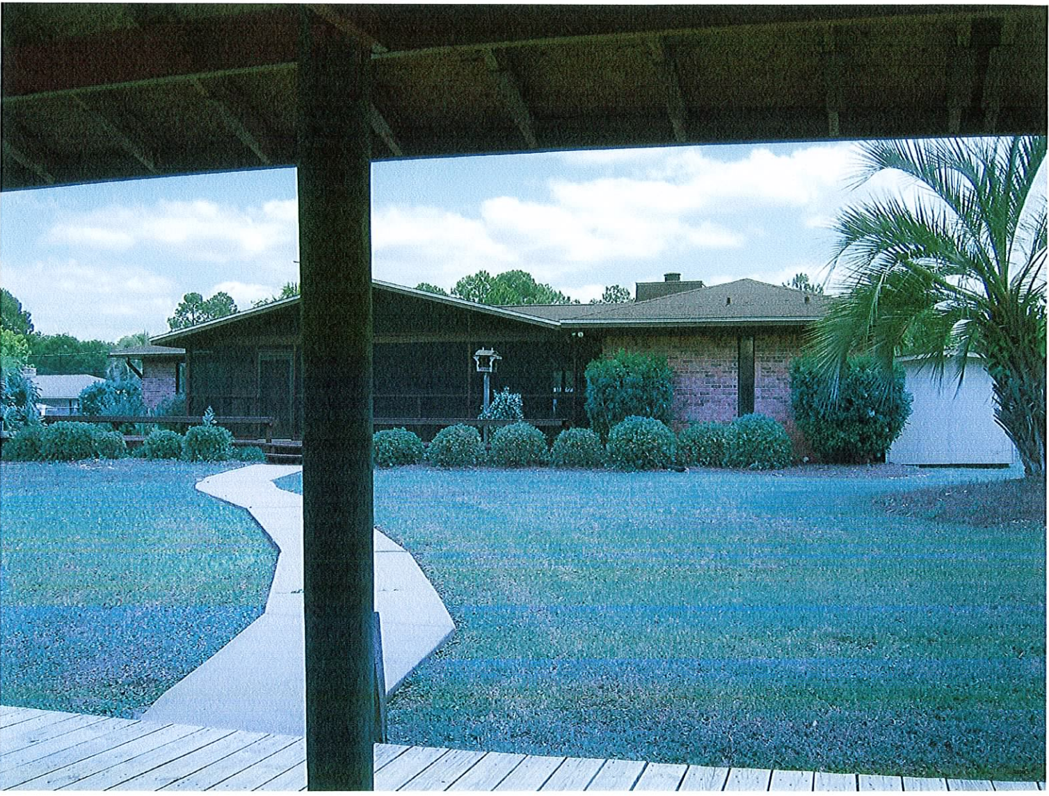
REAR VIEW 4/27/09

If submitting more photographs than will fit on the preceding page, affix the additional photographs below. Identify all photographs with: date taken; "Front View" and "Rear View"; and, if required, "Right Side View" and "Left Side View."