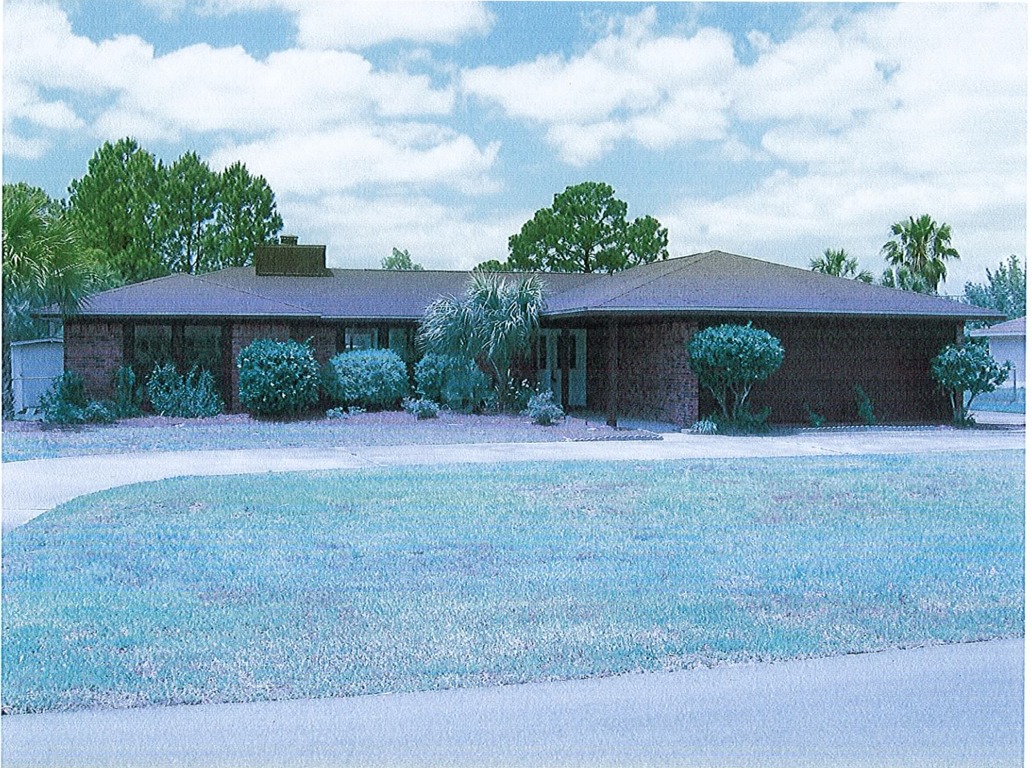
FRONT VIEW 4/27/09

If using the Elevation Certificate to obtain NFIP flood insurance, affix at least two building photographs below according to the instructions for Item A6. Identify all photographs with: date taken; "Front View" and "Rear View"; and, if required, "Right Side View" and "Left Side View." If submitting more photographs than will fit on this page, use the Continuation Page, following.