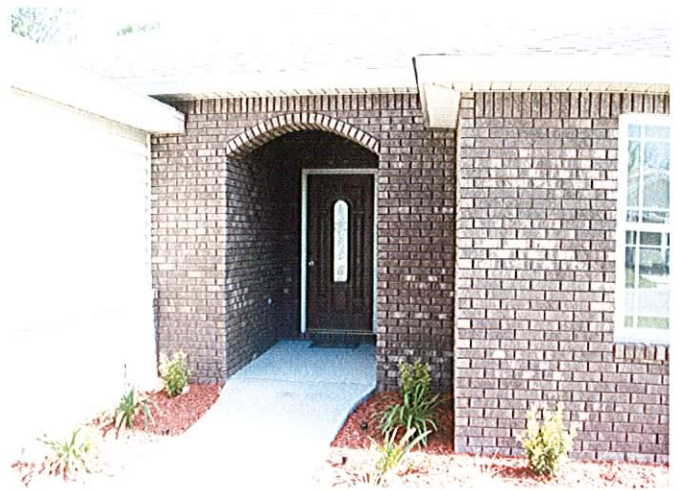
6413 Wildwood Court