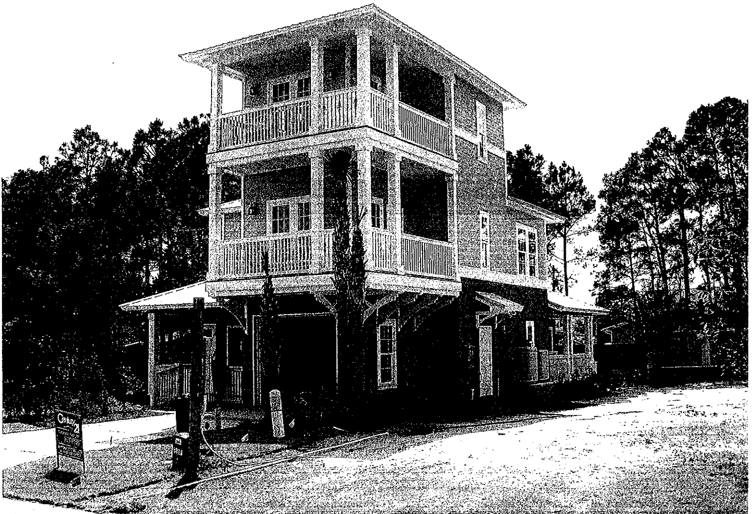
FRONT & RIGHT VIEW 4/16/09

If using the Elevation Certificate to obtain NFIP flood insurance, affix at least two building photographs below according to the instructions for Item A6. Identify all photographs with: date taken; "Front View" and "Rear View"; and, if required, "Right Side View" and "Left Side View." If submitting more photographs than will fit on this page, use the Continuation Page, following.