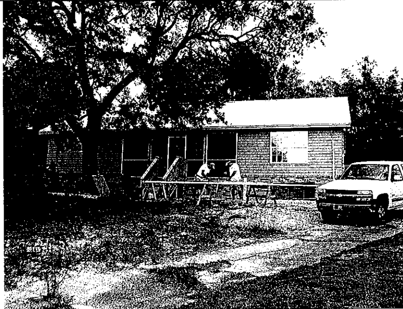
10 SEPTEMBER 2009 -- FRONT VIEW

If using the Elevation Certificate to obtain NFIP flood insurance, affix at least two building photographs below according to the instructions for Item A6. Identify all photographs with: date taken; "Front View" and "Rear View"; and, if required, "Right Side View" and "Left Side View." If submitting more photographs than will fit on this page, use the Continuation Page on the reverse.