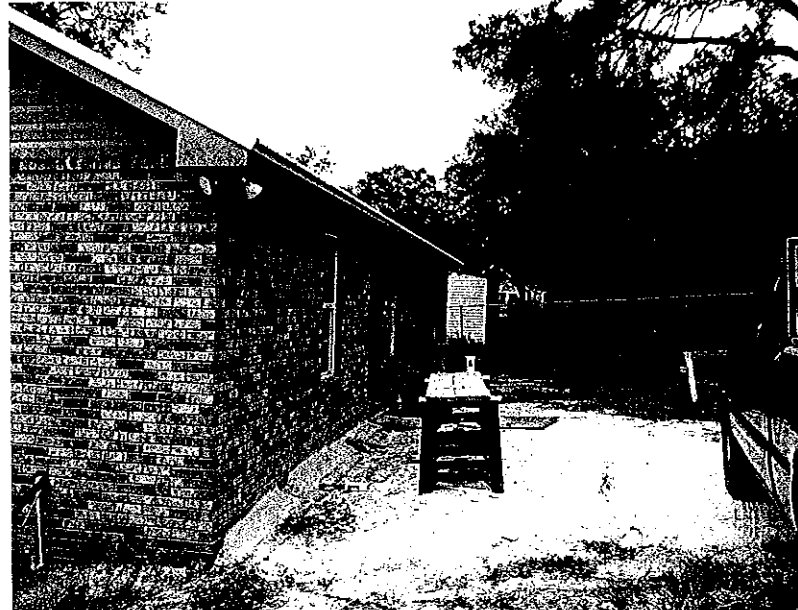
10 SEPTEMBER 2009 -- REAR VIEW