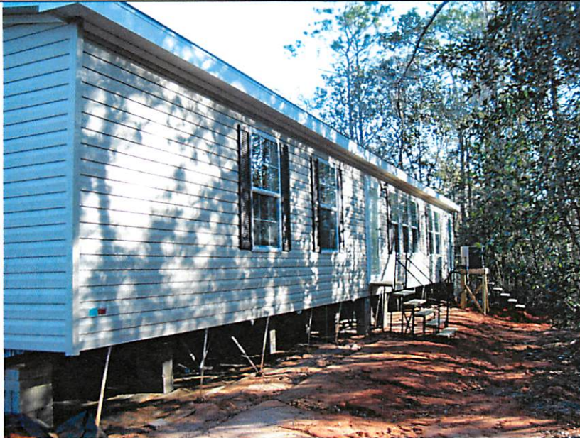
17 FEBRUARY 2010 -- FRONT VIEW