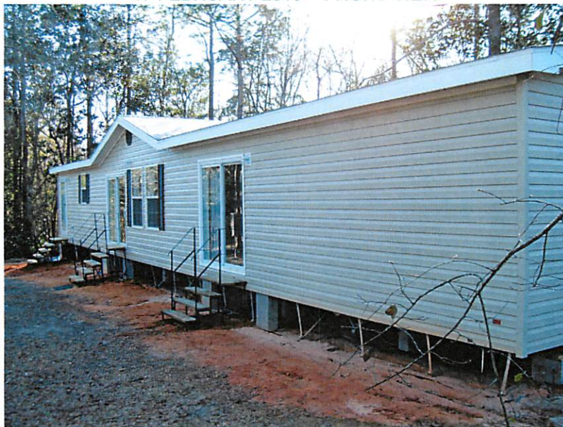
17 FEBRUARY 2010 -- REAR VIEW