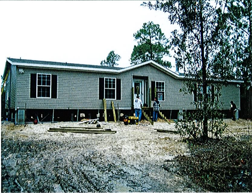
4 DECEMBER 2009 -- FRONT VIEW

If using the Elevation Certificate to obtain NFIP flood insurance, affix at least two building photographs below according to the instructions for Item A6. Identify all photographs with: date taken; "Front View" and "Rear View"; and, if required, "Right Side View" and "Left Side View." If submitting more photographs than will fit on this page, use the Continuation Page on the reverse.