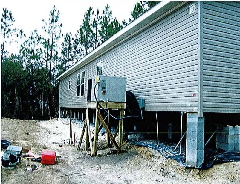
4 DECEMBER 2009 -- REAR VIEW