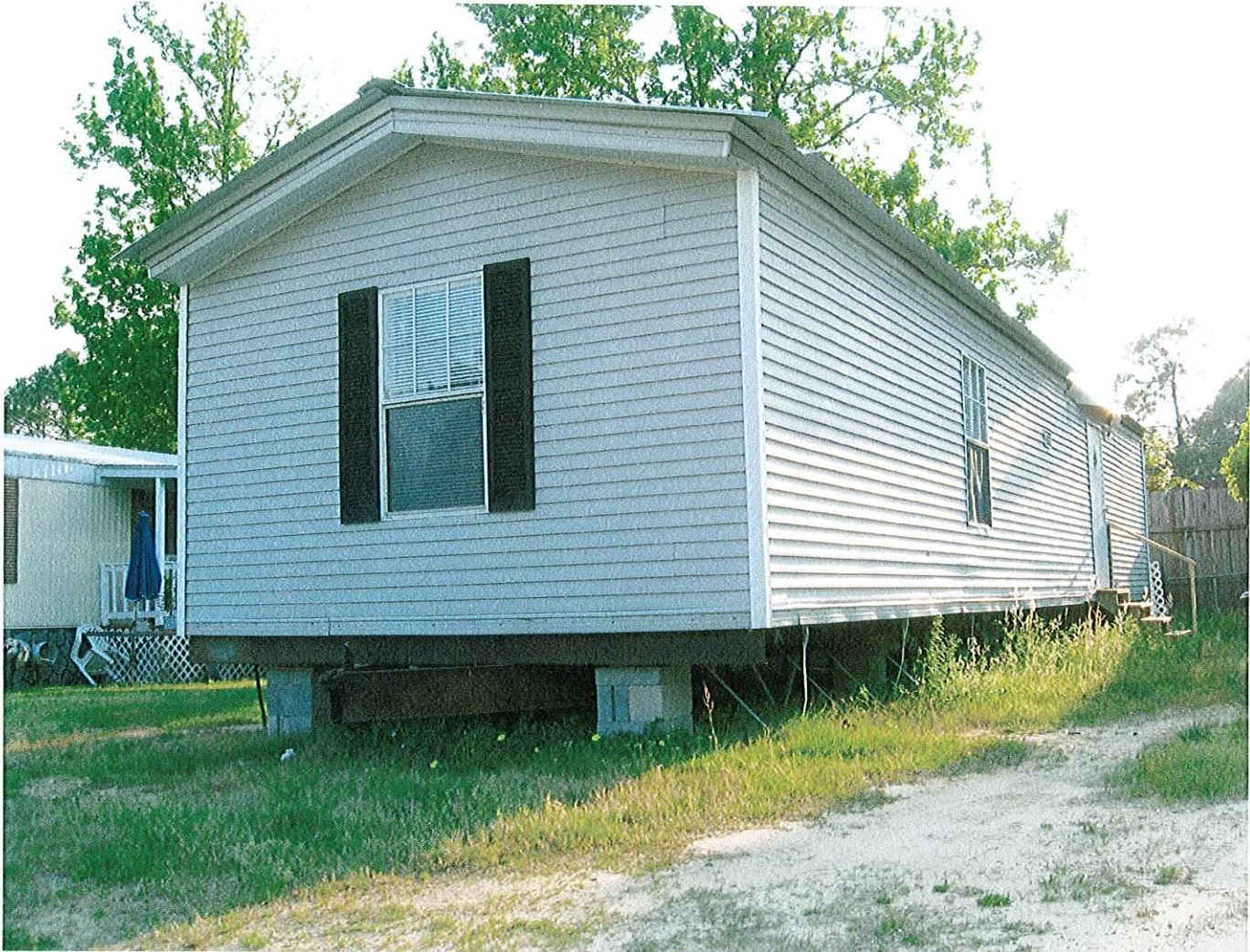
REAR VIEW 04/15/2010