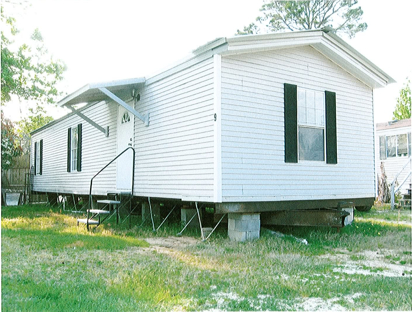
FRONT VIEW 04/15/2010

If using the Elevation Certificate to obtain NFIP flood insurance, affix at least two building photographs below according to the instructions for Item A6. Identify all photographs with: date taken; "Front View" and "Rear View"; and, if required, "Right Side View" and "Left Side View." If submitting more photographs than will fit on this page, use the Continuation Page on the reverse.