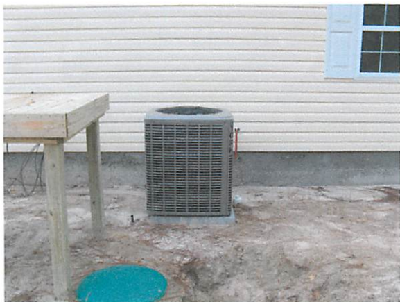
12/3/09: A/C VIEW