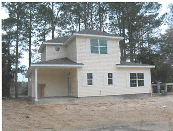
12/3/09: FRONT VIEW