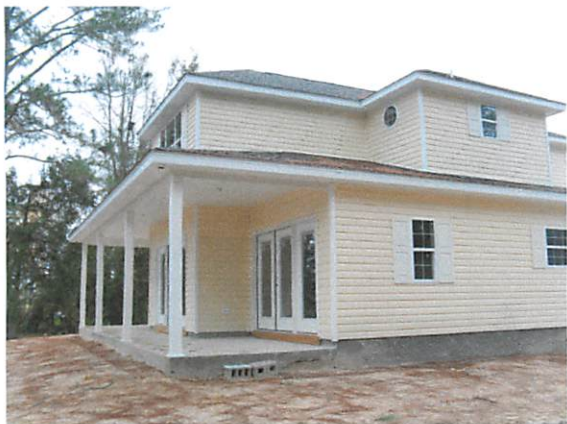
12/3/09: SIDE VIEW

If using the Elevation Certificate to obtain NFIP flood insurance, affix at least two building photographs below according to the instructions for Item A6. Identify all photographs with: date taken; "Front View" and "Rear View"; and, if required, "Right Side View" and "Left Side View." If submitting more photographs than will fit on this page, use the Continuation Page on the reverse.