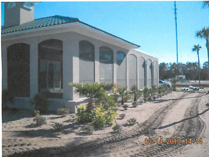
VIEW LOOKING W'LY. ALONG N. WALL OF RES. 12/14/10