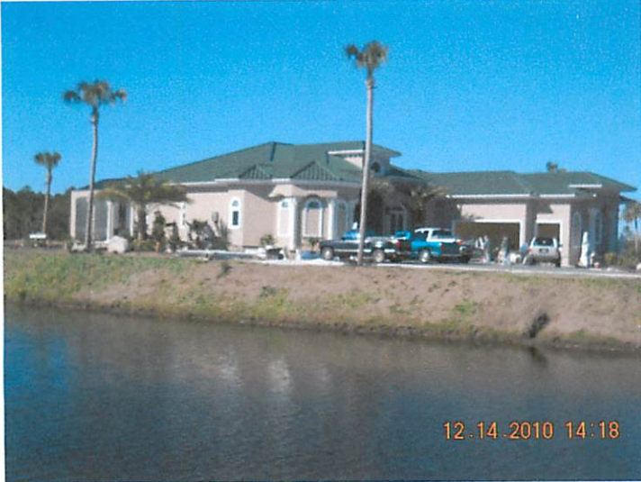
WEST SIDE OF RES. LOOKING NE'LY. 12/14/10

If submitting more photographs than will fit on the preceding page, affix the additional photographs below. Identify all photographs with: date taken; "Front View" and "Rear View"; and, if required, "Right Side View" and "Left Side View."