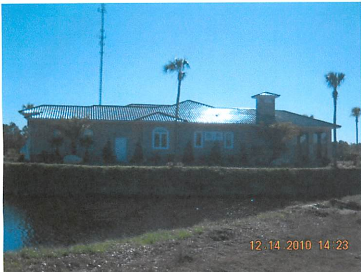
EAST SIDE OF RES. LOOKING W'LY. 12/14/10