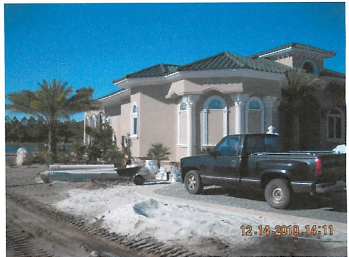
VIEW LOOKING NE'LY. FROM S. SIDE OF RES. 12/14/10