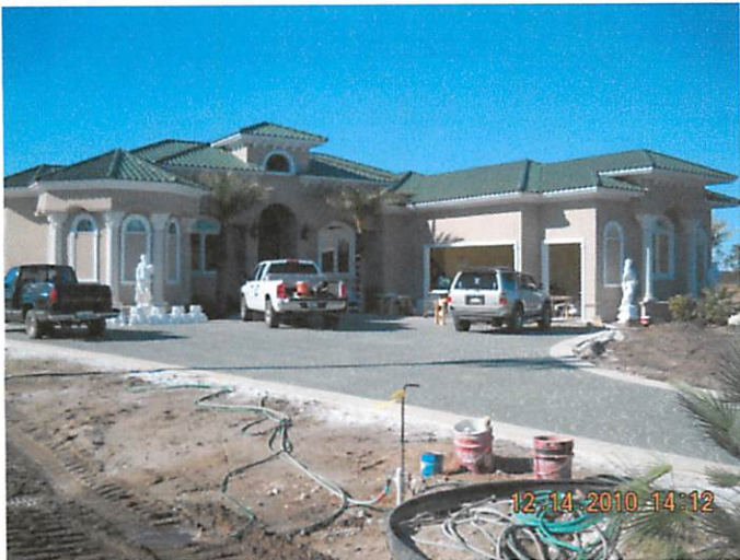
VIEW LOOKING N'ELY. FROM S. SIDE OF RES. 12/14/10

If using the Elevation Certificate to obtain NFIP flood insurance, affix at least two building photographs below according to the instructions for Item A6. Identify all photographs with: date taken; "Front View" and "Rear View"; and, if required, "Right Side View" and "Left Side View." If submitting more photographs than will fit on this page, use the Continuation Page, following.