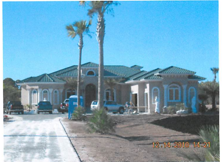
SOUTH SIDE OF RES. LOOKING N'LY. 12/14/10