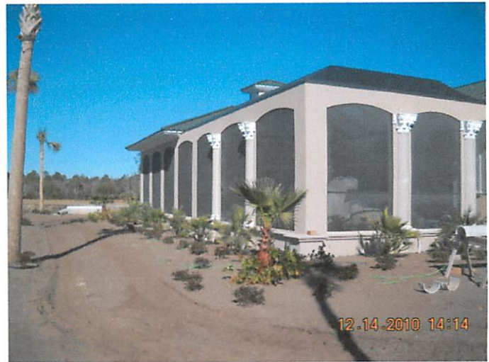
VIEW LOOKING E'LY. ALONG N. WALL OF RES. 12/14/10