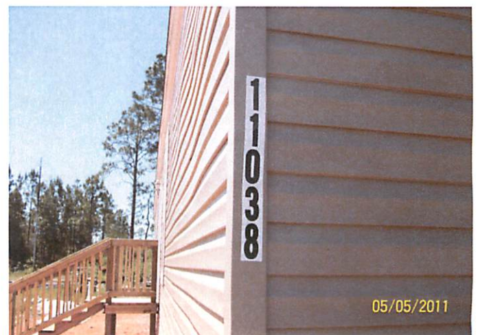
11038 Silver Lake Rd., Fountain, FL