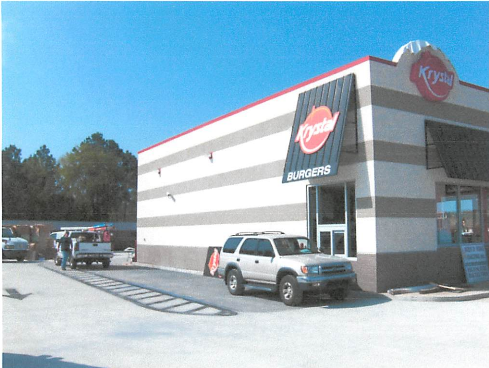
West Side View