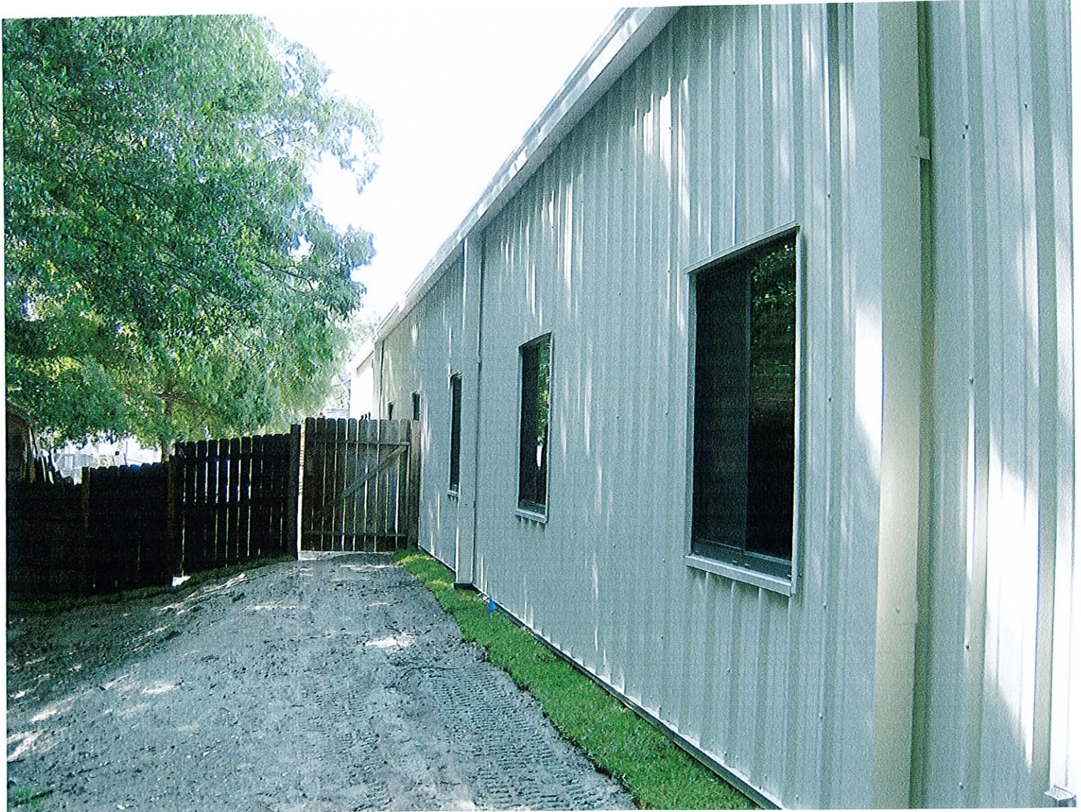
REAR VIEW 6/10/10