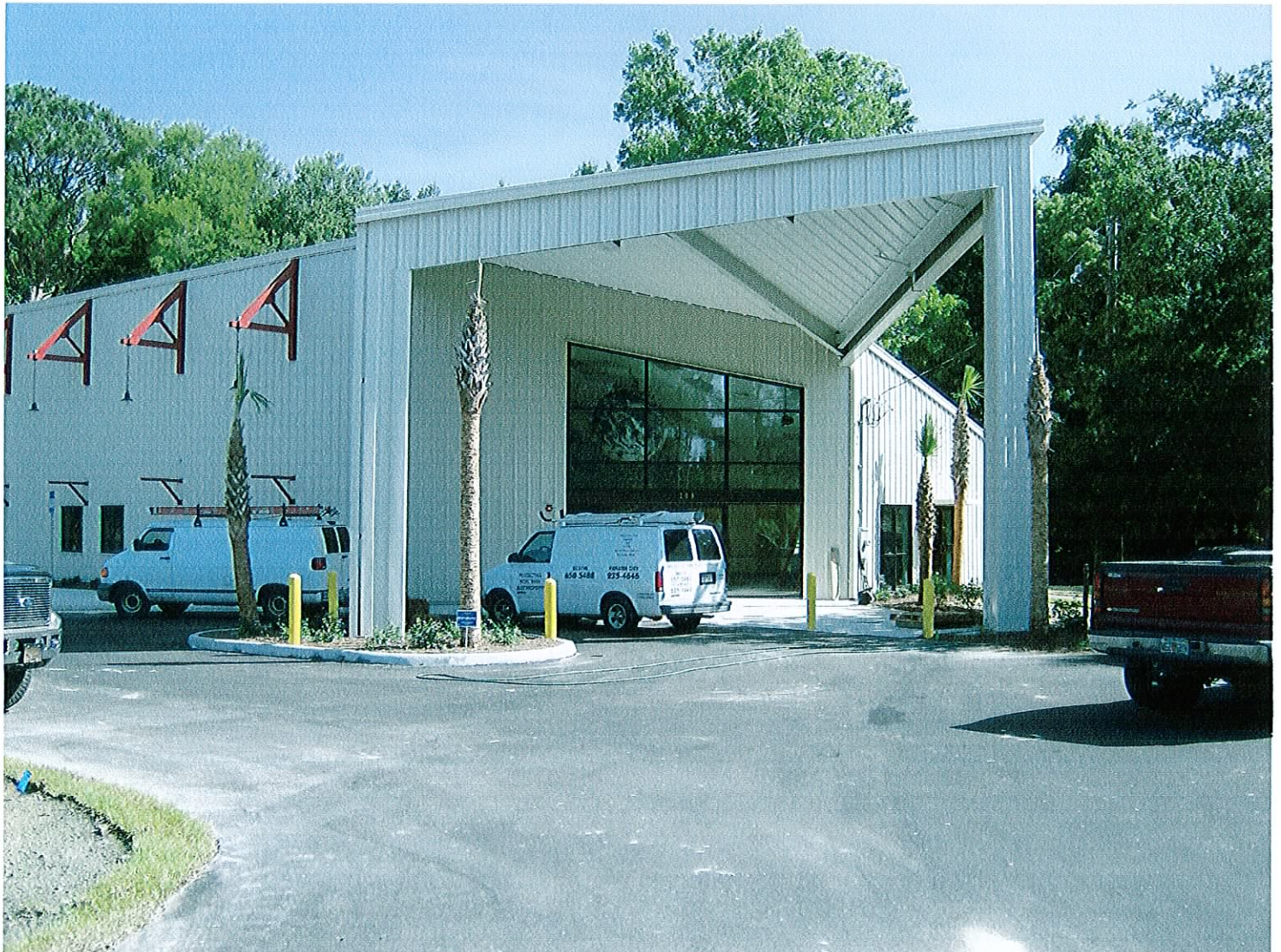
FRONT VIEW 6/10/10

If using the Elevation Certificate to obtain NFIP flood insurance, affix at least two building photographs below according to the instructions for Item A6. Identify all photographs with: date taken; "Front View" and "Rear View"; and, if required, "Right Side View" and "Left Side View." If submitting more photographs than will fit on this page, use the Continuation Page, following.