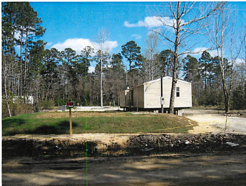
10 MARCH 2011 -- REAR VIEW