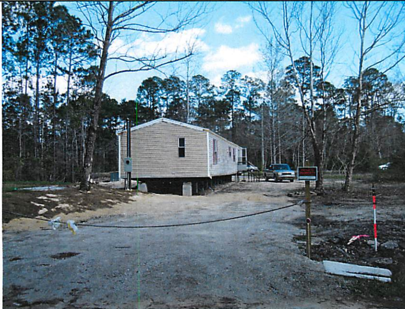
10 MARCH 2011 -- FRONT VIEW

If using the Elevation Certificate to obtain NFIP flood insurance, affix at least two building photographs below according to the instructions for Item A6. Identify all photographs with: date taken; "Front View" and "Rear View"; and, if required, "Right Side View" and "Left Side View." If submitting more photographs than will fit on this page, use the Continuation Page on the reverse.