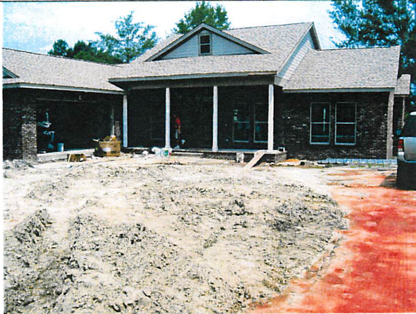
2 AUGUST 2011-- FRONT VIEW

If using the Elevation Certificate to obtain NFIP flood insurance, affix at least two building photographs below according to the instructions for Item A6. Identify all photographs with: date taken; "Front View" and "Rear View"; and, if required, "Right Side View" and "Left Side View." If submitting more photographs than will fit on this page, use the Continuation Page on the reverse.