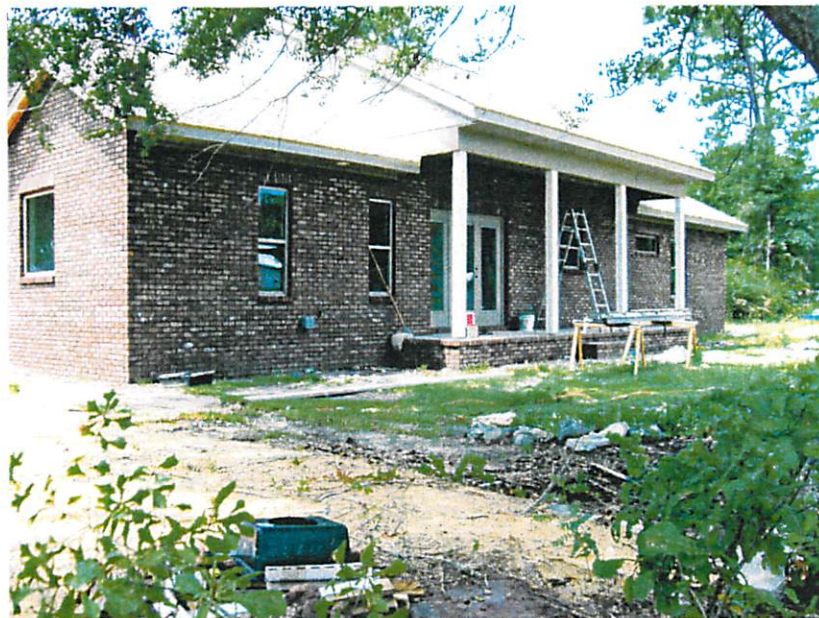
2 AUGUST 2011-- REAR VIEW