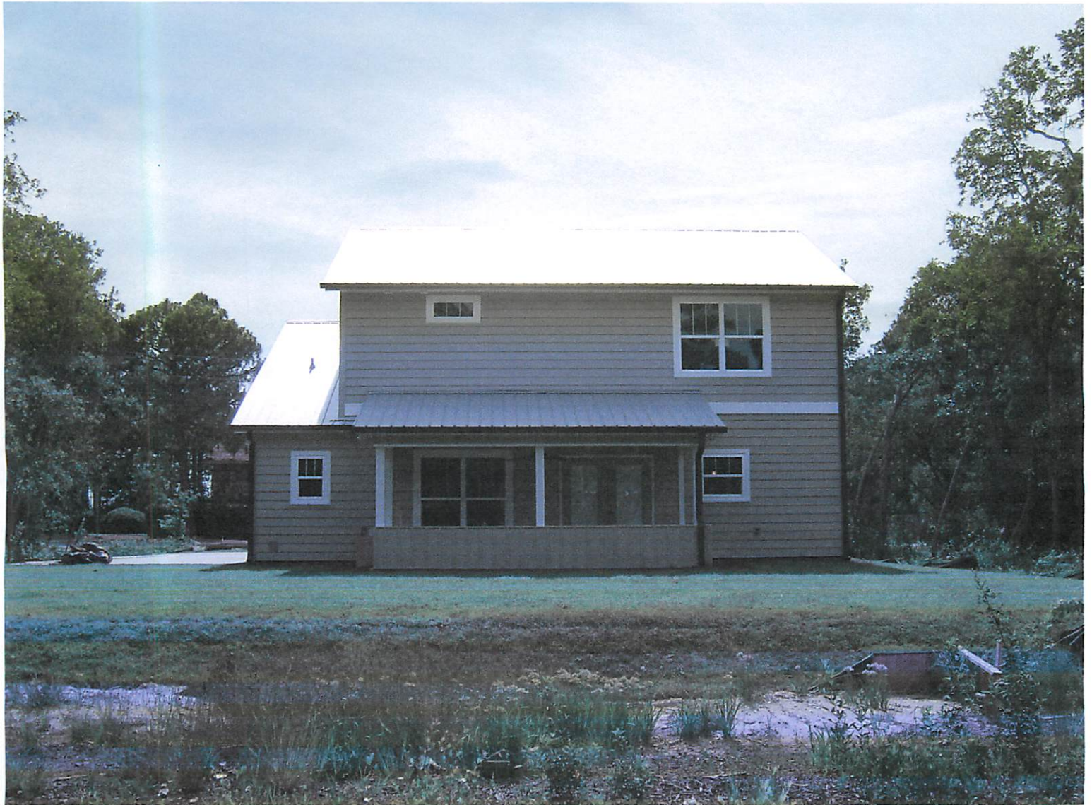
REAR VIEW 6/24/11

If submitting more photographs than will fit on the preceding page, affix the additional photographs below. Identify all photographs with: date taken; "Front View" and "Rear View"; and, if required, "Right Side View" and "Left Side View."