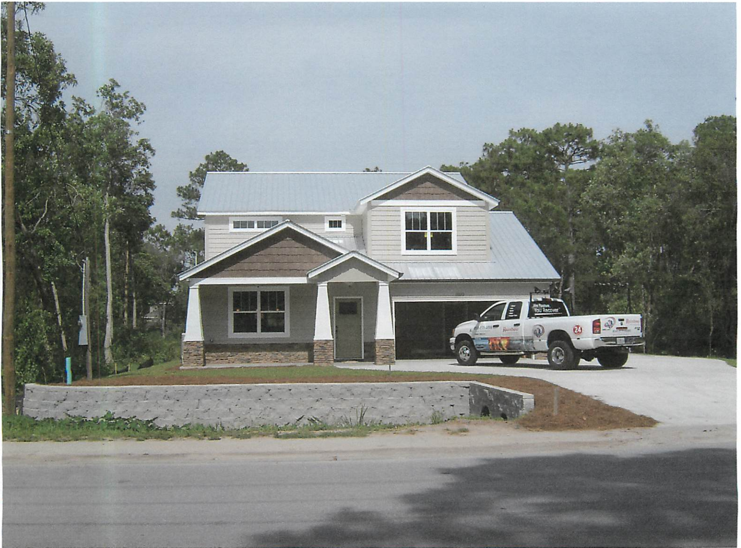
FRONT VIEW 6/24/11

If using the Elevation Certificate to obtain NFIP flood insurance, affix at least two building photographs below according to the instructions for Item A6. Identify all photographs with: date taken; "Front View" and "Rear View"; and, if required, "Right Side View" and "Left Side View." If submitting more photographs than will fit on this page, use the Continuation Page, following.