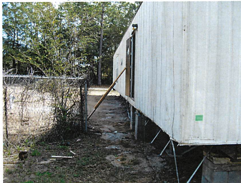
8 MARCH 2011 -- REAR VIEW