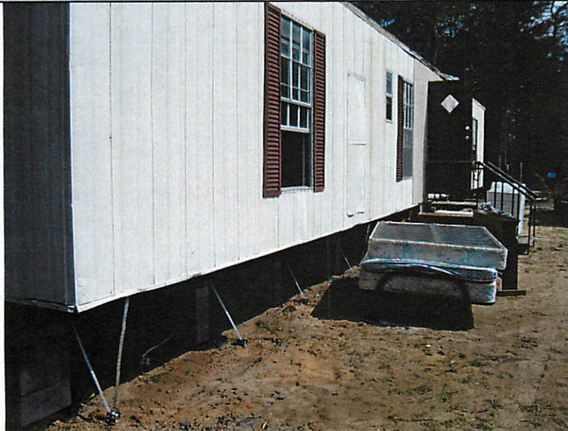
8 MARCH 2011 -- FRONT VIEW

If using the Elevation Certificate to obtain NFIP flood insurance, affix at least two building photographs below according to the instructions for Item A6. Identify all photographs with: date taken; "Front View" and "Rear View"; and, if required, "Right Side View" and "Left Side View." If submitting more photographs than will fit on this page, use the Continuation Page on the reverse.