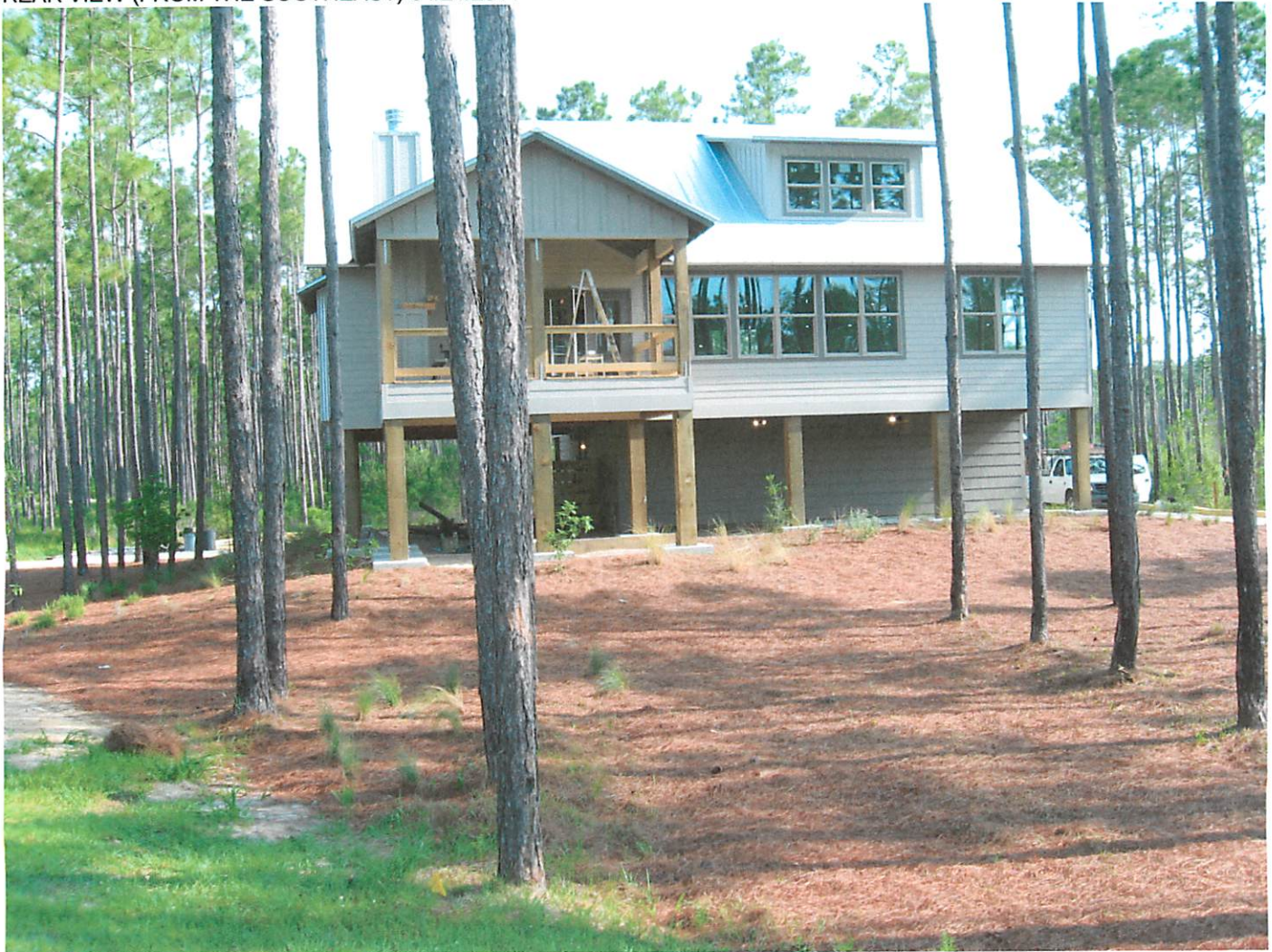
REAR VIEW (FROM THE SOUTHEAST) 04/21/2011

If submitting more photographs than will fit on the preceding page, affix the additional photographs below. Identify all photographs with: date taken; "Front View" and "Rear View"; and, if required, "Right Side View" and "Left Side View."