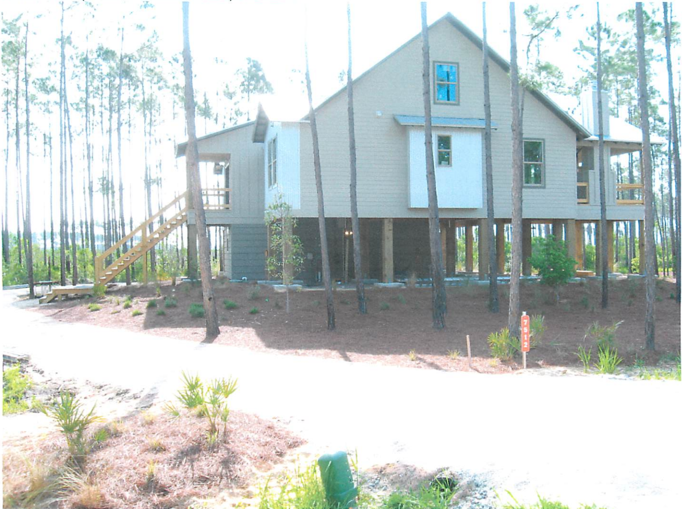
FRONT VIEW (FROM THE SOUTHWEST) 04/21/2011