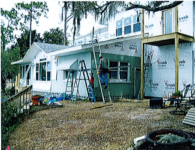
24 MARCH 2010 -- REAR VIEW