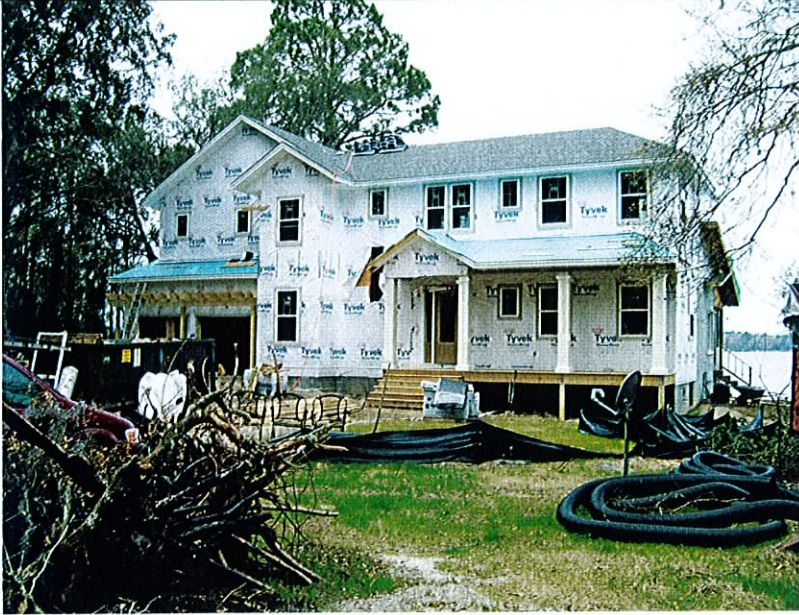
24 MARCH 2010 -- FRONT VIEW

If using the Elevation Certificate to obtain NFIP flood insurance, affix at least two building photographs below according to the instructions for Item A6. Identify all photographs with: date taken; "Front View" and "Rear View"; and, if required, "Right Side View" and "Left Side View." If submitting more photographs than will fit on this page, use the Continuation Page on the reverse.