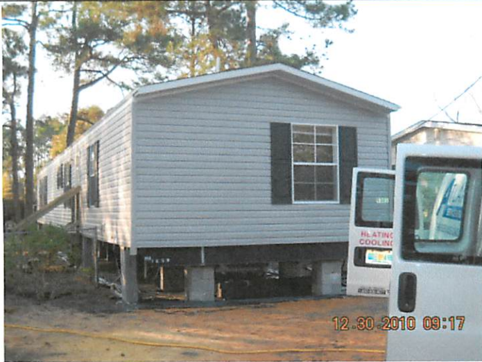
FRONT VIEW (ROAD SIDE)

If using the Elevation Certificate to obtain NFIP flood insurance, affix at least two building photographs below according to the instructions for Item A6. Identify all photographs with: date taken; "Front View" and "Rear View"; and, if required, "Right Side View" and "Left Side View." If submitting more photographs than will fit on this page, use the Continuation Page, following.