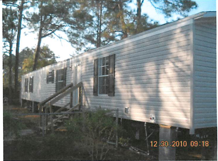
LEFT SIDE VIE