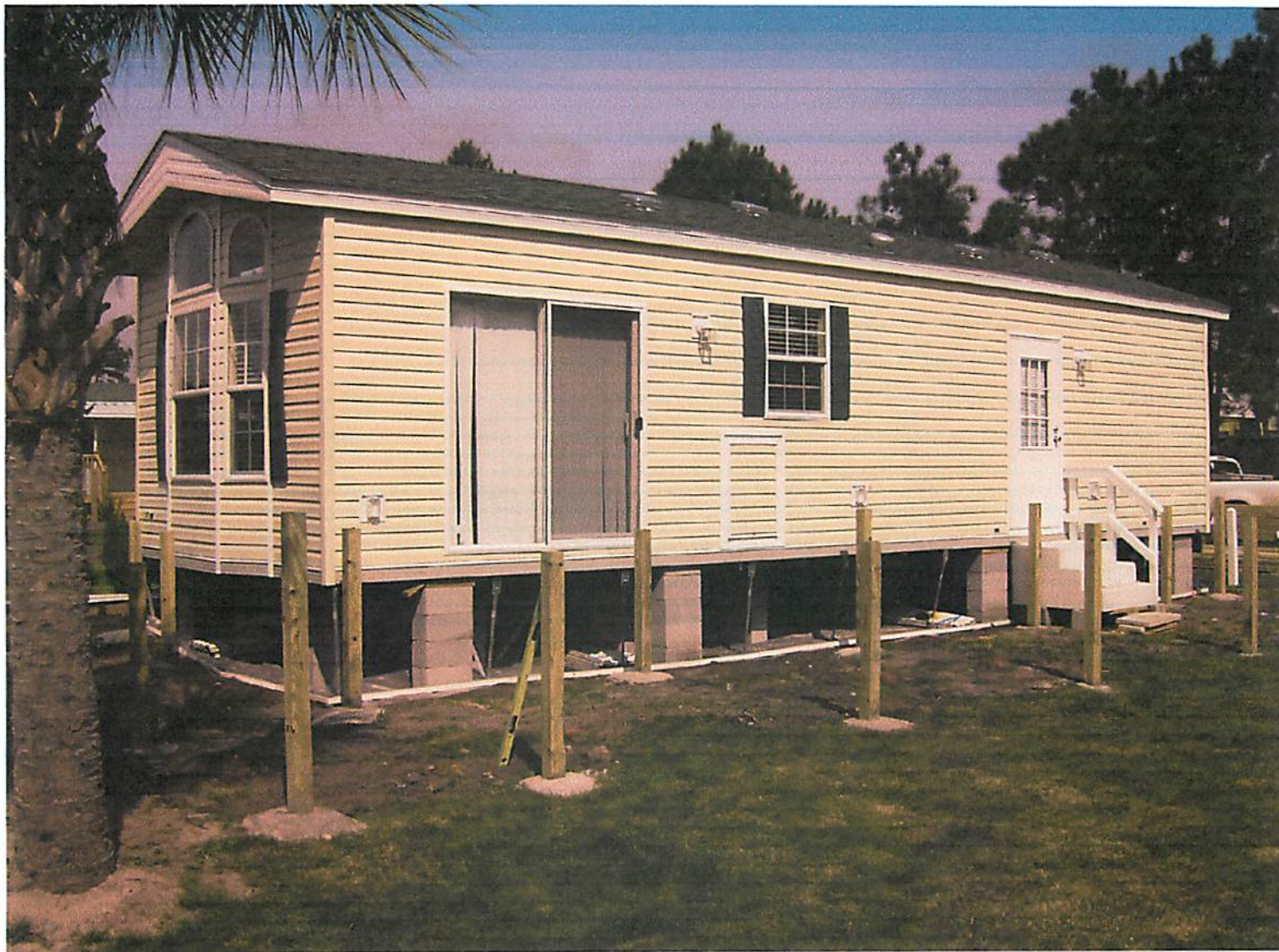
FRONT & LEFT SIDE VIEW 02/23/12

If using the Elevation Certificate to obtain NFIP flood insurance, affix at least two building photographs below according to the instructions for Item A6. Identify all photographs with: date taken; "Front View" and "Rear View"; and, if required, "Right Side View" and "Left Side View." If submitting more photographs than will fit on this page, use the Continuation Page, following.