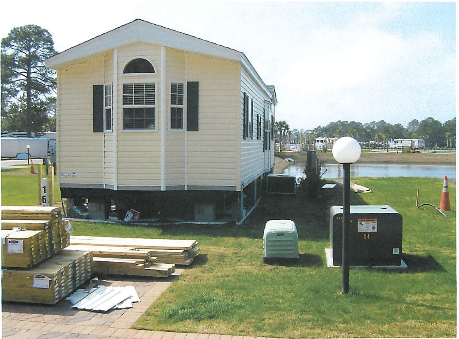
REAR & RIGHT SIDE VIEW 02/23/12