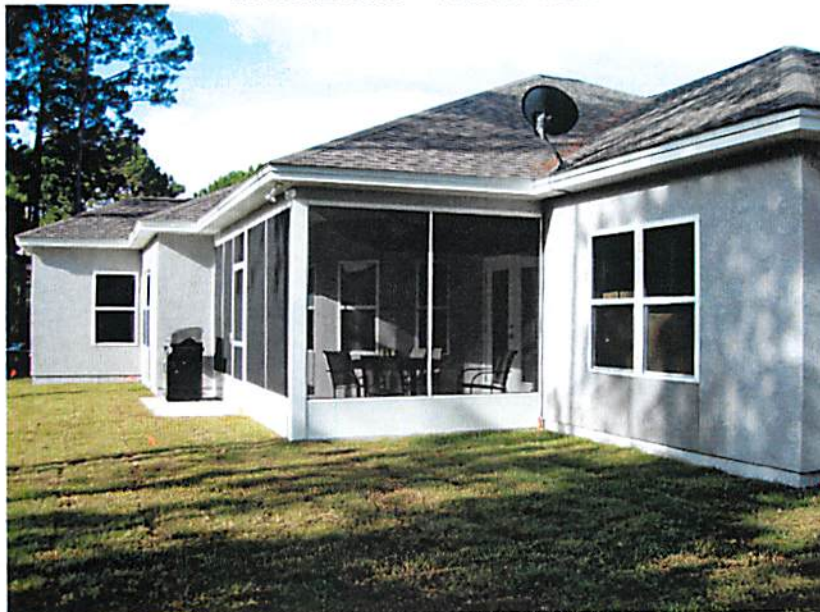
20 JUNE 2012 -- REAR VIEW