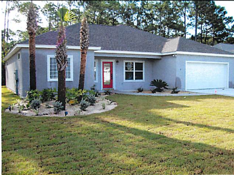
20 JUNE 2012 -- FRONT VIEW

If using the Elevation Certificate to obtain NFIP flood insurance, affix at least two building photographs below according to the instructions for Item A6. Identify all photographs with: date taken; "Front View" and "Rear View"; and, if required, "Right Side View" and "Left Side View." If submitting more photographs than will fit on this page, use the Continuation Page on the reverse.