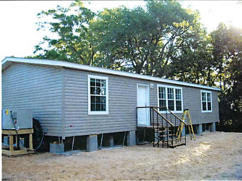
1 MAY 2012 -- FRONT VIEW

If using the Elevation Certificate to obtain NFIP flood insurance, affix at least two building photographs below according to the instructions for Item A6. Identify all photographs with: date taken; "Front View" and "Rear View"; and, if required, "Right Side View" and "Left Side View." If submitting more photographs than will fit on this page, use the Continuation Page on the reverse.