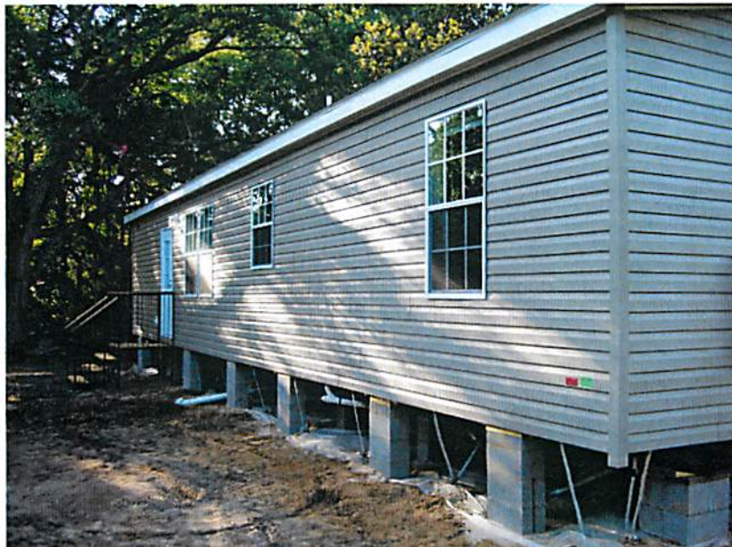
1 MAY 2012 -- REAR VIEW