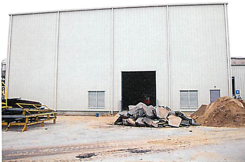
SIDE VIEW (2-1-12)