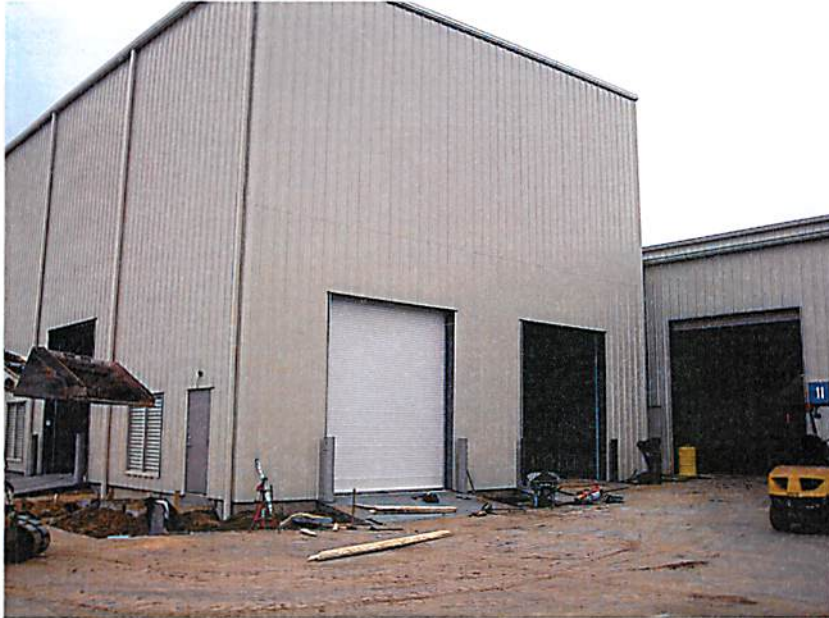
FRONT VIEW (2-1-12)

If using the Elevation Certificate to obtain NFIP flood insurance, affix at least two building photographs below according to the instructions for Item A6. Identify all photographs with: date taken; "Front View" and "Rear View"; and, if required, "Right Side View" and "Left Side View." If submitting more photographs than will fit on this page, use the Continuation Page, following.