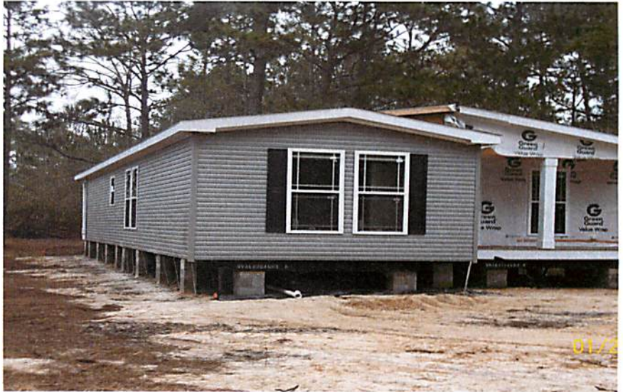
PARCEL A, LTO 49, PEACAN & FIG GROVE