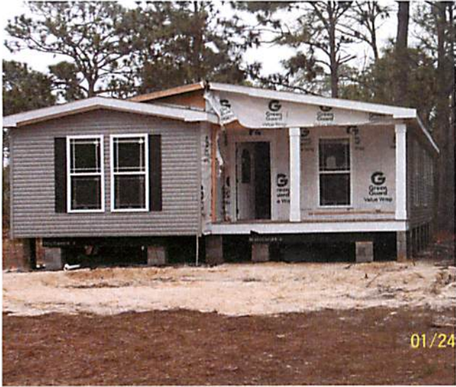
PARCEL A, LTO 49, PEACAN & FIG GROVE

If using the Elevation Certificate to obtain NFIP flood insurance, affix at least two building photographs below according to the instructions for Item A6. Identify all photographs with: date taken; "Front View" and "Rear View"; and, if required, "Right Side View" and "Left Side View." If submitting more photographs than will fit on this page, use the Continuation Page, following.