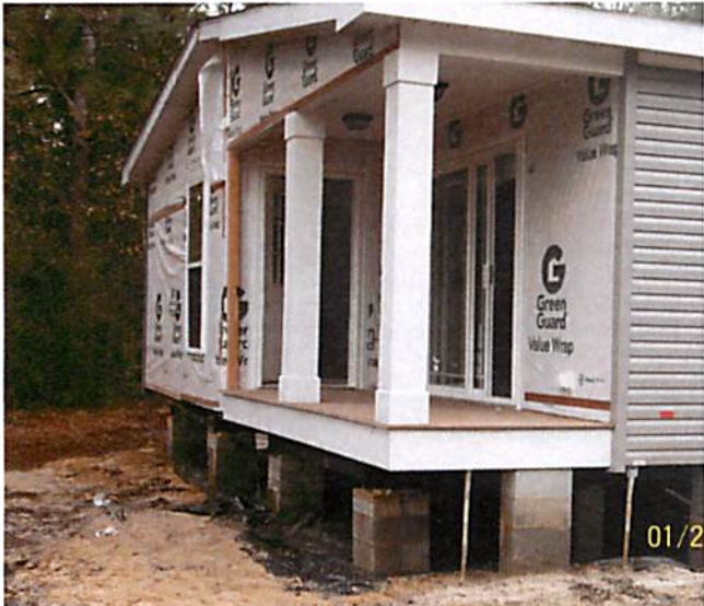
PARCEL A, LTO 49, PEACAN & FIG GROVE