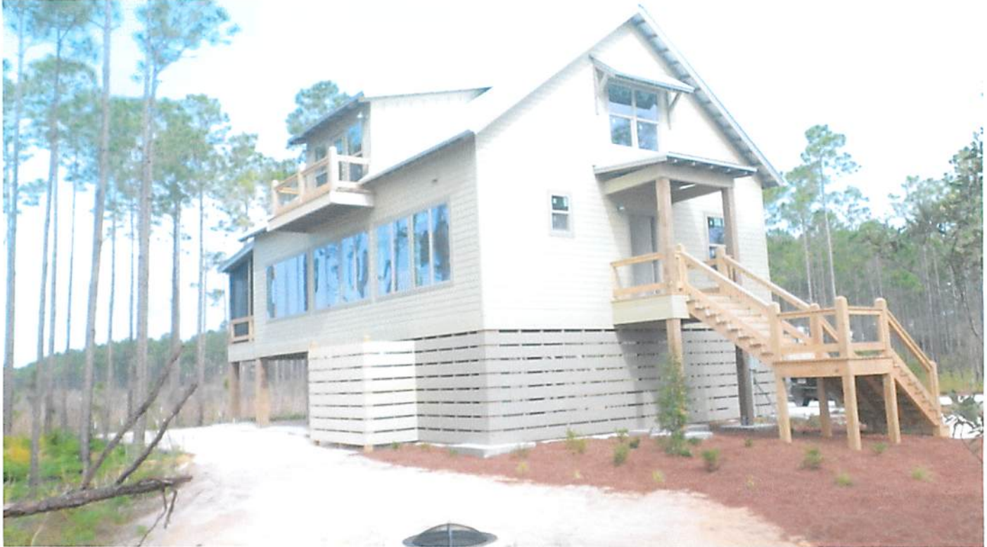
REAR VIEW 04/02/2012

If submitting more photographs than will fit on the preceding page, affix the additional photographs below. Identify all photographs with: date taken; "Front View" and "Rear View"; and, if required, "Right Side View" and "Left Side View."