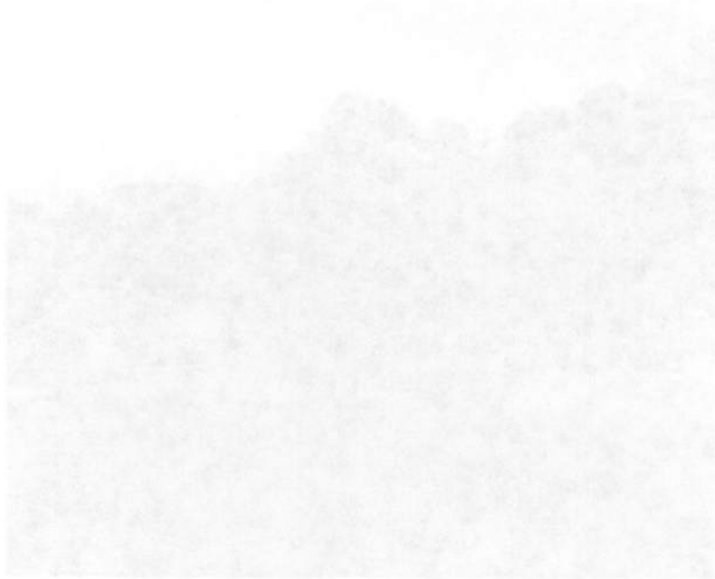
(61-08-15) FRONT VIEW