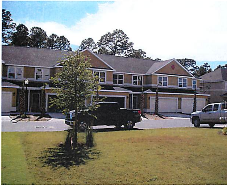
FRONT VIEW (6-3-13)

If using the Elevation Certificate to obtain NFIP flood insurance, affix at least two building photographs below according to the instructions for Item A6. Identify all photographs with: date taken; "Front View" and "Rear View"; and, if required, "Right Side View" and "Left Side View." If submitting more photographs than will fit on this page, use the Continuation Page, following.