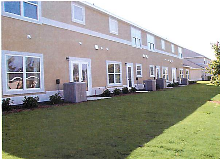
REAR VIEW (6-3-13)