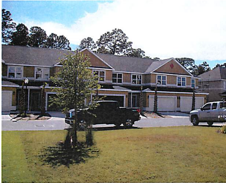
FRONT VIEW (6-3-13)

If using the Elevation Certificate to obtain NFIP flood insurance, affix at least two building photographs below according to the instructions for Item A6. Identify all photographs with: date taken; "Front View" and "Rear View"; and, if required, "Right Side View" and "Left Side View." If submitting more photographs than will fit on this page, use the Continuation Page, following.