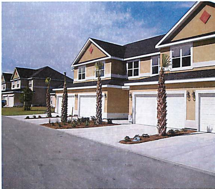
FRONT VIEW (6-3-13)

If using the Elevation Certificate to obtain NFIP flood insurance, affix at least two building photographs below according to the instructions for Item A6. Identify all photographs with: date taken; "Front View" and "Rear View"; and, if required, "Right Side View" and "Left Side View." If submitting more photographs than will fit on this page, use the Continuation Page, following.