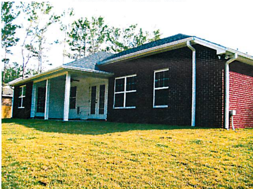
14 JUNE 2013 -- REAR VIEW