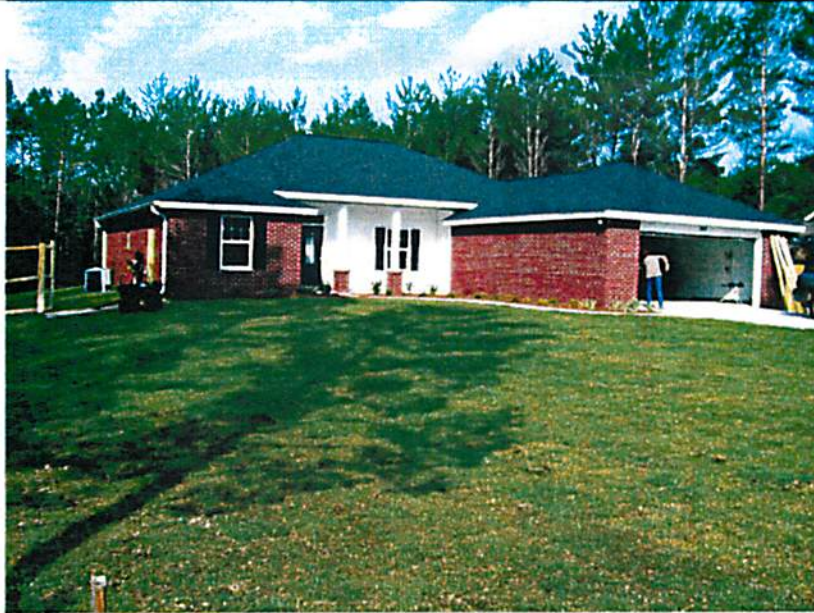
14 JUNE 2013 -- FRONT VIEW

If using the Elevation Certificate to obtain NFIP flood insurance, affix at least two building photographs below according to the instructions for Item A6. Identify all photographs with: date taken; "Front View" and "Rear View"; and, if required, "Right Side View" and "Left Side View." If submitting more photographs than will fit on this page, use the Continuation Page on the reverse.