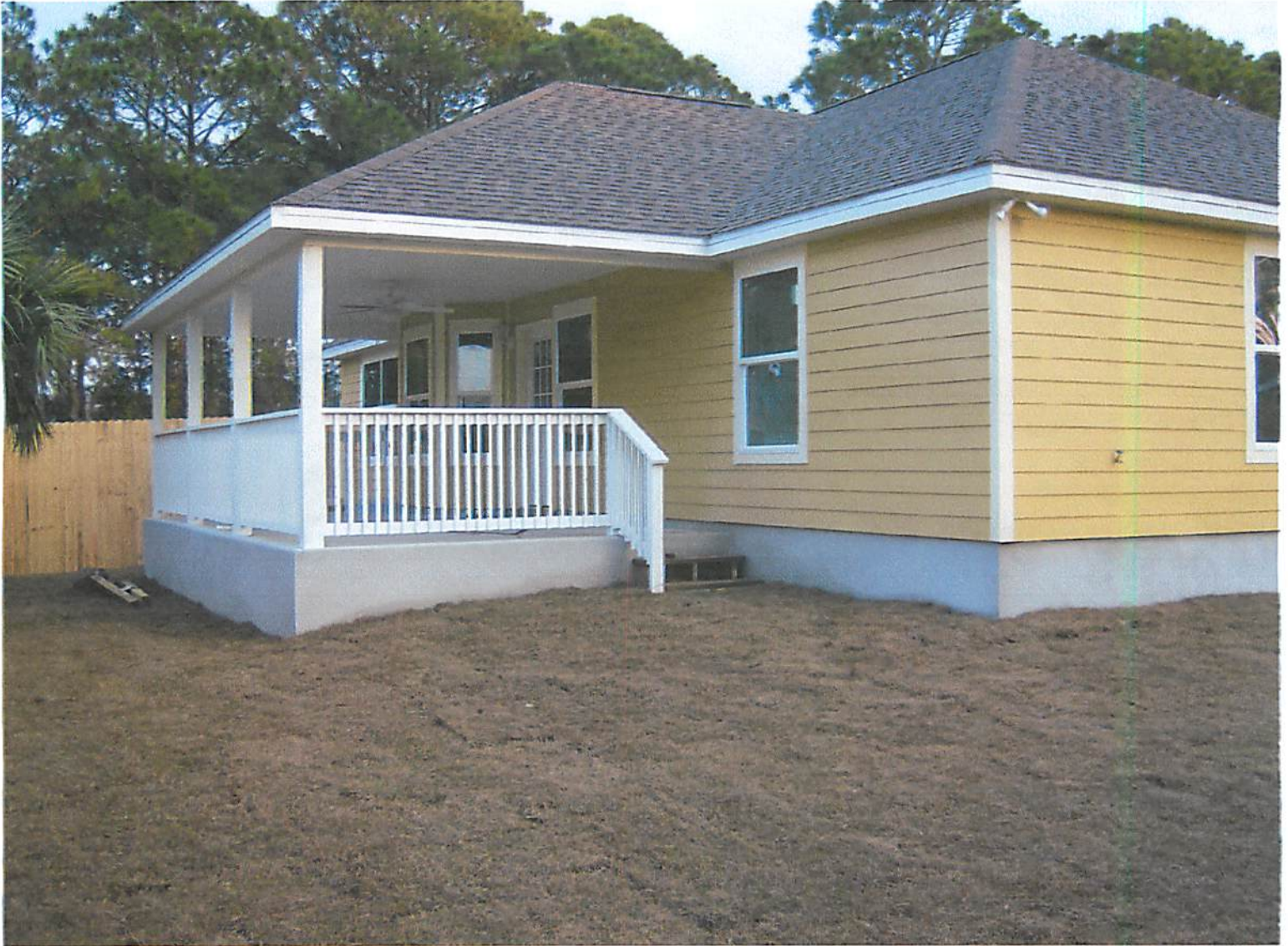
REAR VIEW 02/08/13