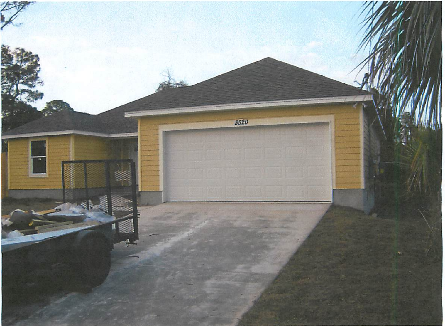
FRONT VIEW 02/08/13

If using the Elevation Certificate to obtain NFIP flood insurance, affix at least two building photographs below according to the instructions for Item A6. Identify all photographs with: date taken; "Front View" and "Rear View"; and, if required, "Right Side View" and "Left Side View." If submitting more photographs than will fit on this page, use the Continuation Page, following.