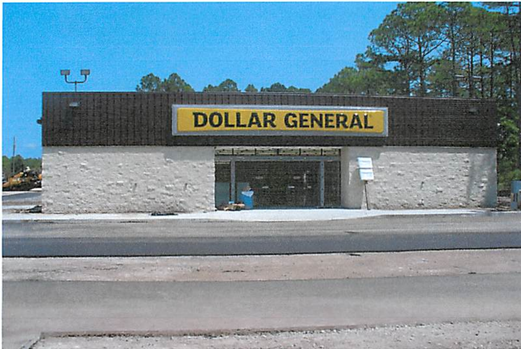
North Side - Rear View with Equipment