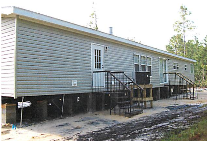
22 JULY 2013 -- REAR VIEW