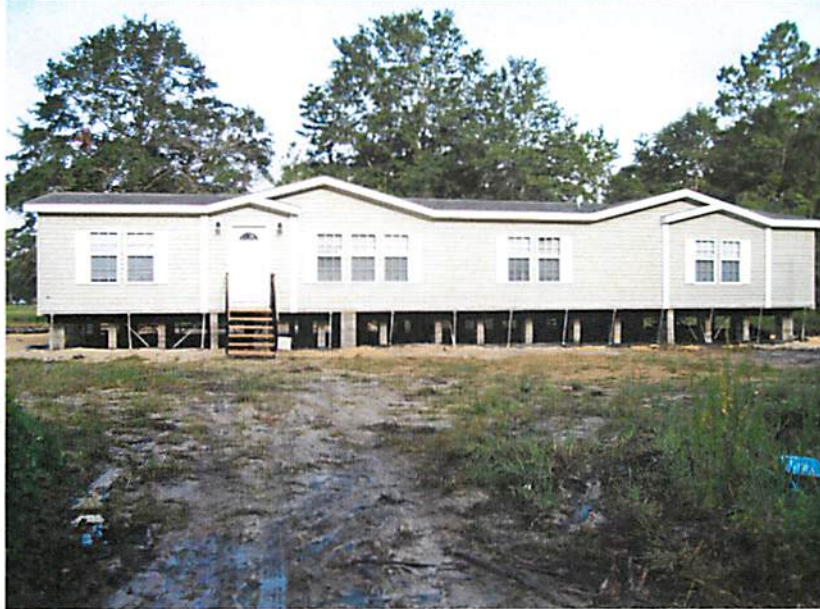
22 JULY 2013-- FRONT VIEW

If using the Elevation Certificate to obtain NFIP flood insurance, affix at least two building photographs below according to the instructions for Item A6. Identify all photographs with: date taken; "Front View" and "Rear View"; and, if required, "Right Side View" and "Left Side View." If submitting more photographs than will fit on this page, use the Continuation Page on the reverse.